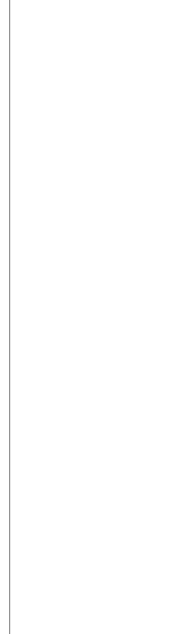
EXISTING GROUND FLOOR PLAN SCALE 1:100 © A3