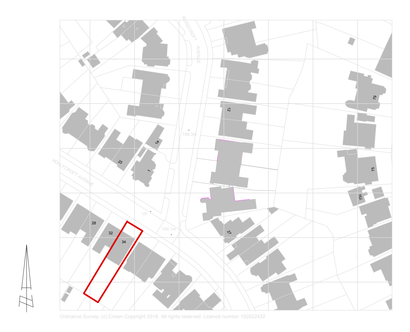
LOCATION PLAN - scale 1:1250 @ A2