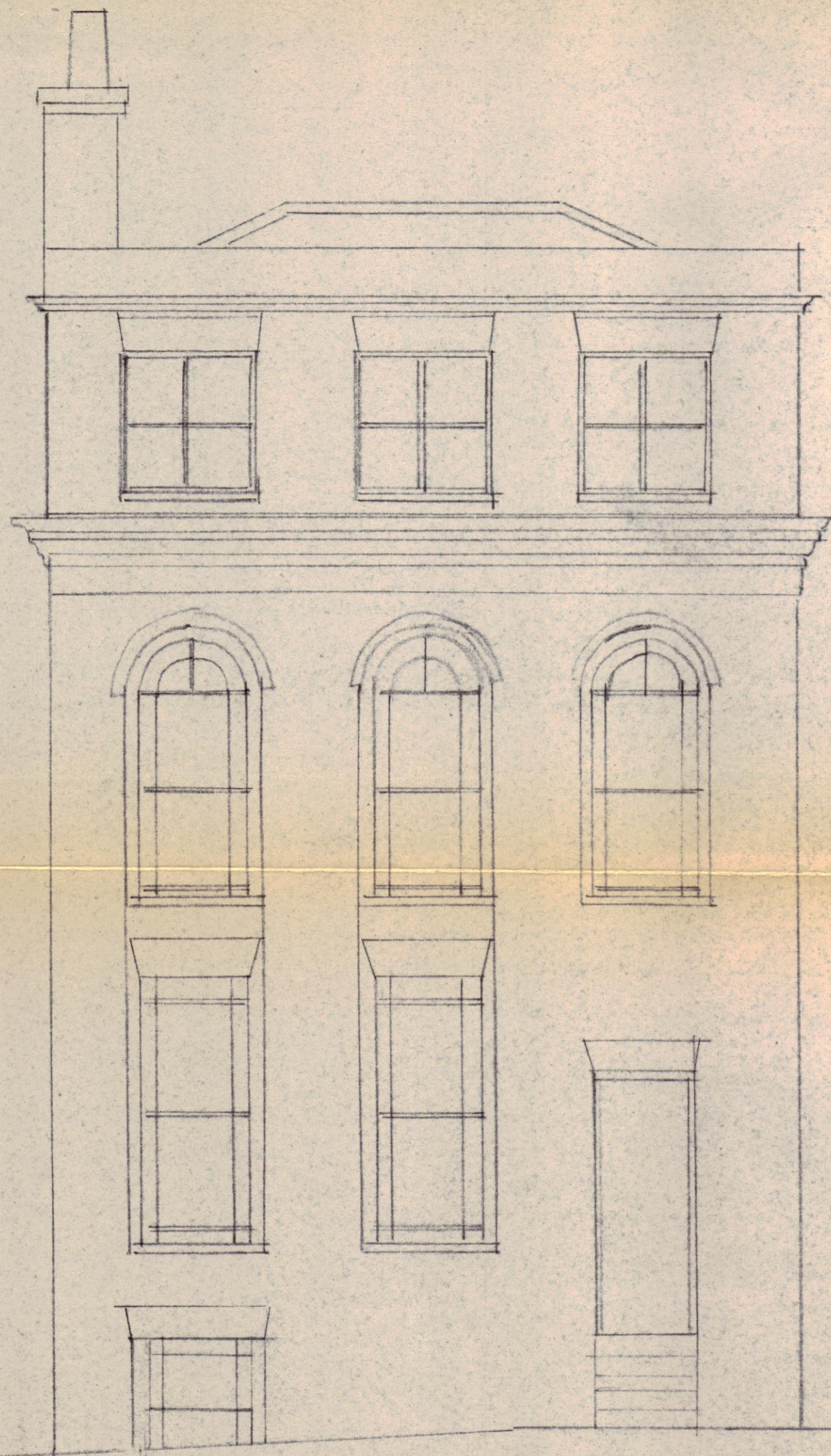
ELEVATION TO ENTRANCE ROADWAY