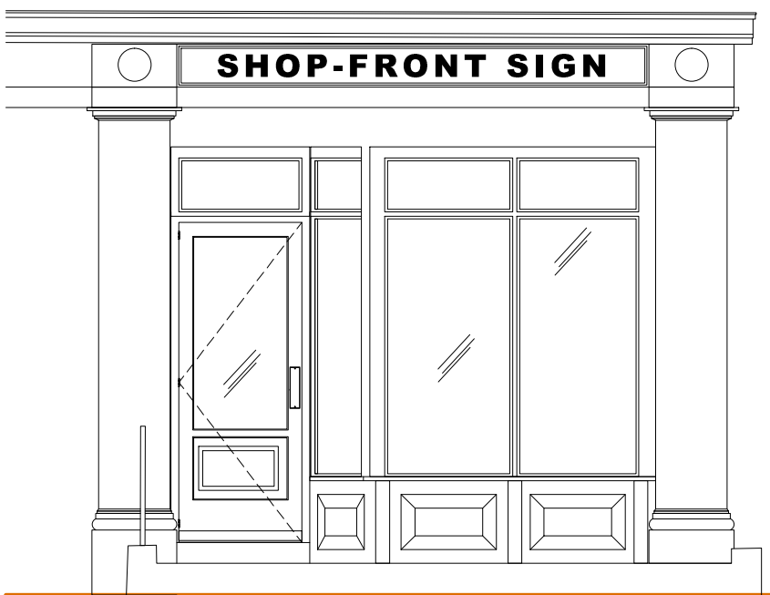
New Shop-front - Elevation Scale 1:50