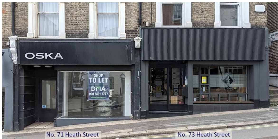
The current existing shopfront

The proposed works are illustrated on the accompanying drawings.