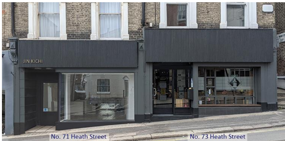
The proposed shopfront