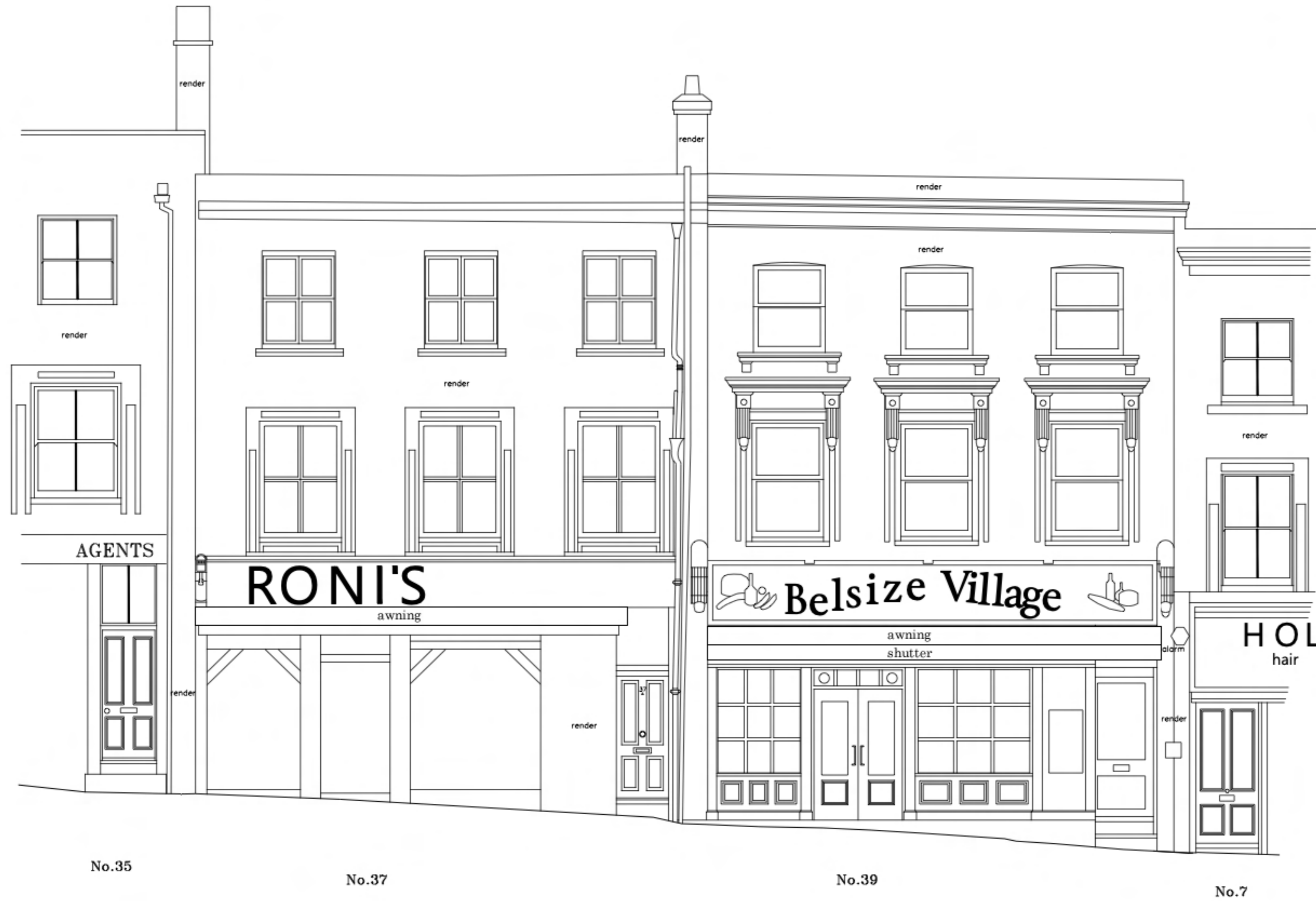
WEST ELEVATION (BELSIZE LANE) A.O.D. 62.00m

THE CO-ORDINATES ARE DERIVED FROM THE ORDNANCE SURVEY ACTIVE STATION NETWORK OSTN15 (BASE STATION ST04)