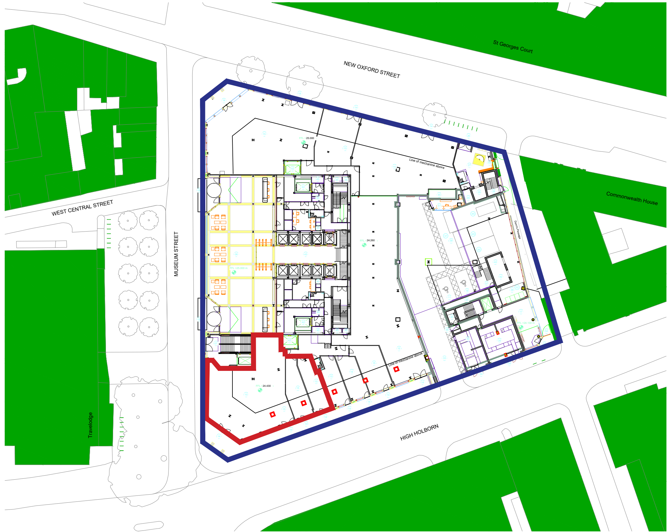
SITE PLAN 1:500 @ A1