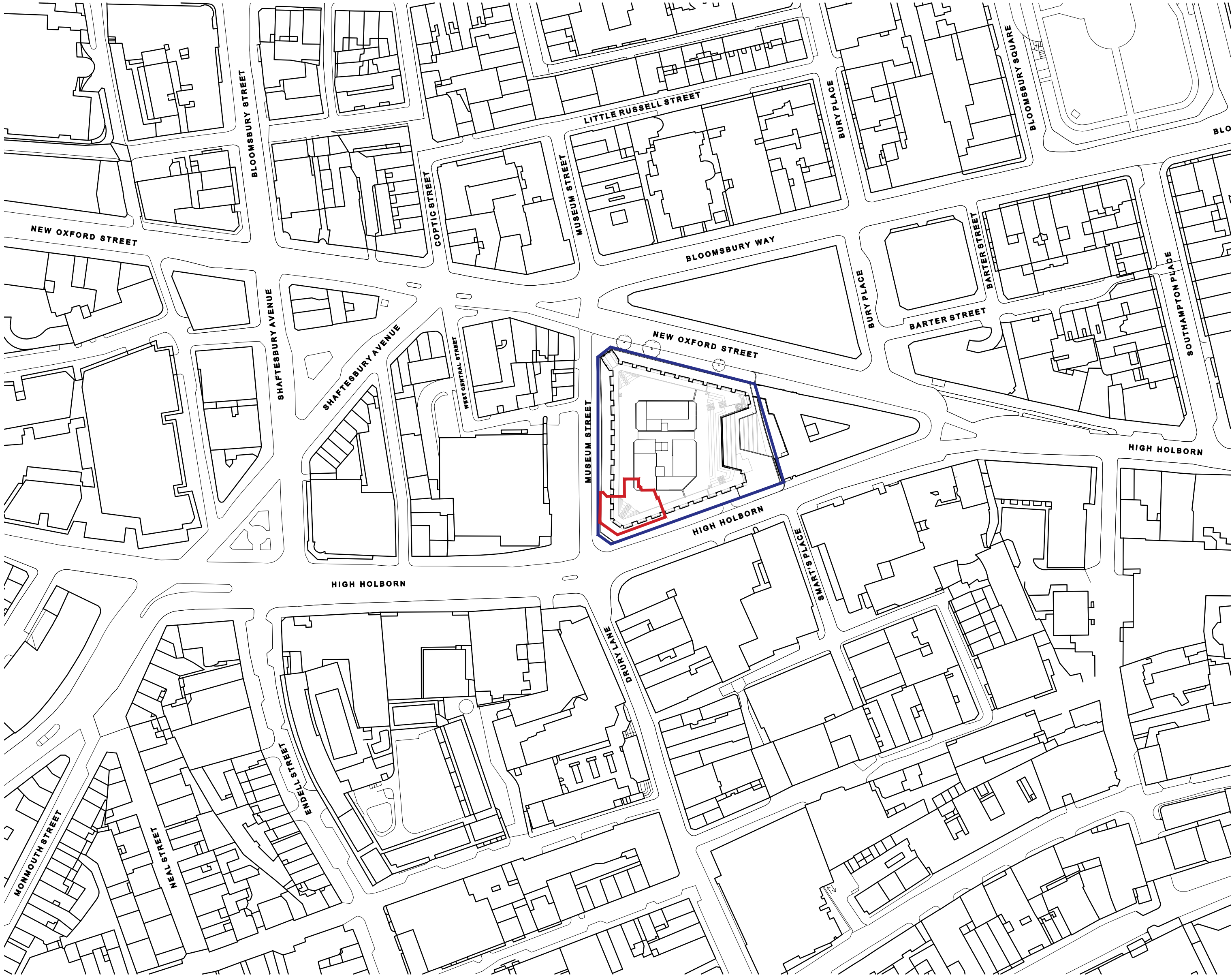
LOCATION PLAN 1:1250 @ A1