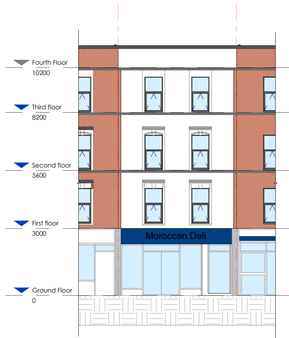
3. EXISTING FRONT ELEVATION 1 : 100