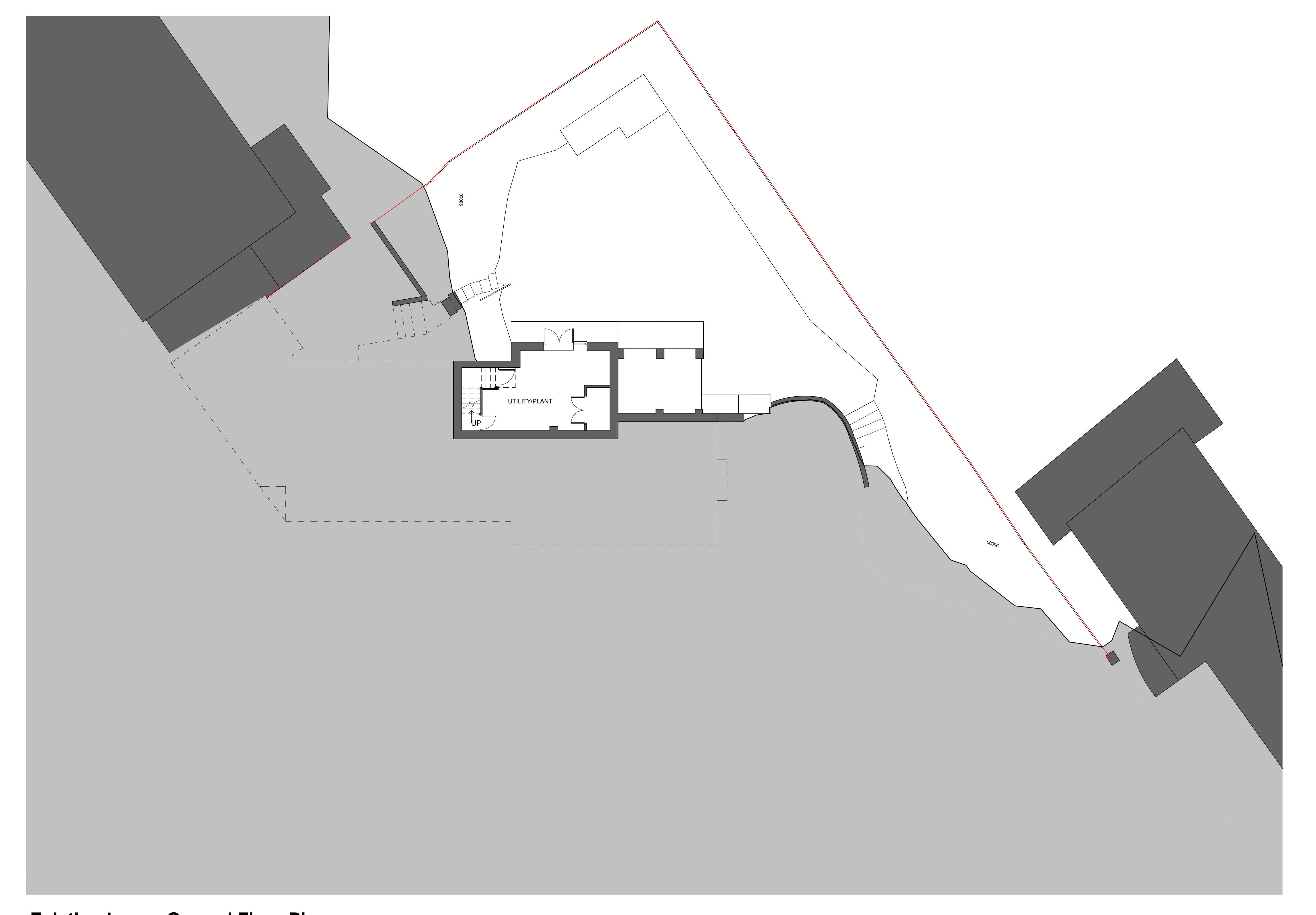
Existing Lower Ground Floor Plan 1: 100

This drawing is protected under Copyright and at no time should any portion of this drawing be reproduced or copied without the permission of the Architect (Design Copyright Act 1968) This drawing must not be used for purposes other than that for which it was provided. It is supplied without liability for any errors or omissions. Drawings only to be scaled for planning application purposes, all dimensions to be checked on site. All drawings subject to Statutory Authority Approval.