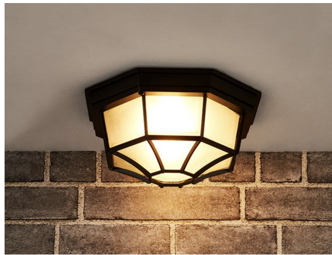
SUGGESTED LIGHT FITTING