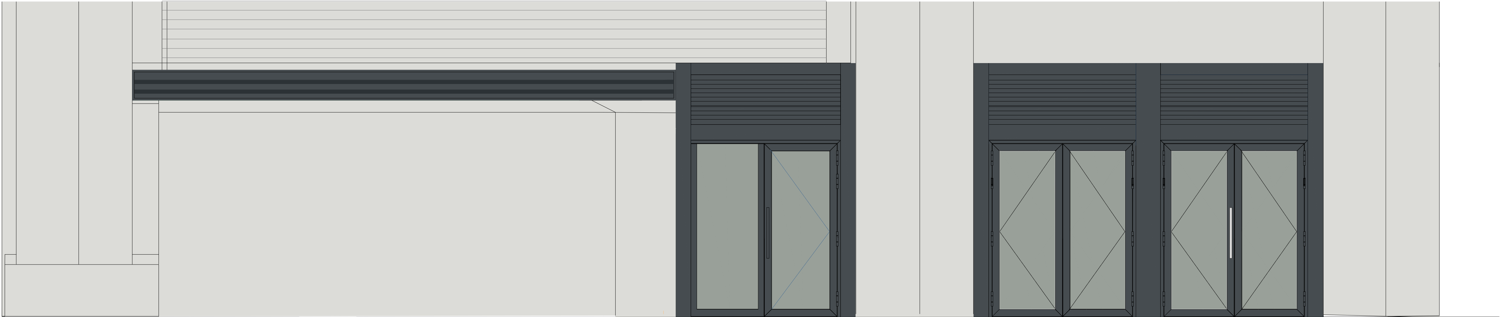
Entrance Elevation scale 1:50