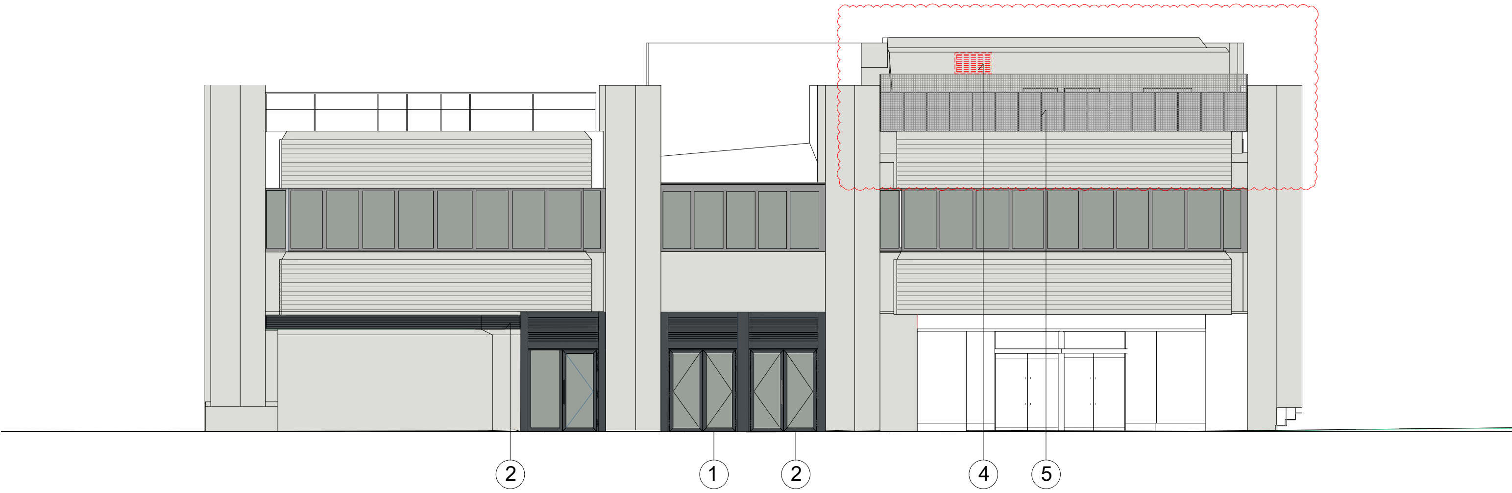
Elevation: Great Russell Street scale 1:200