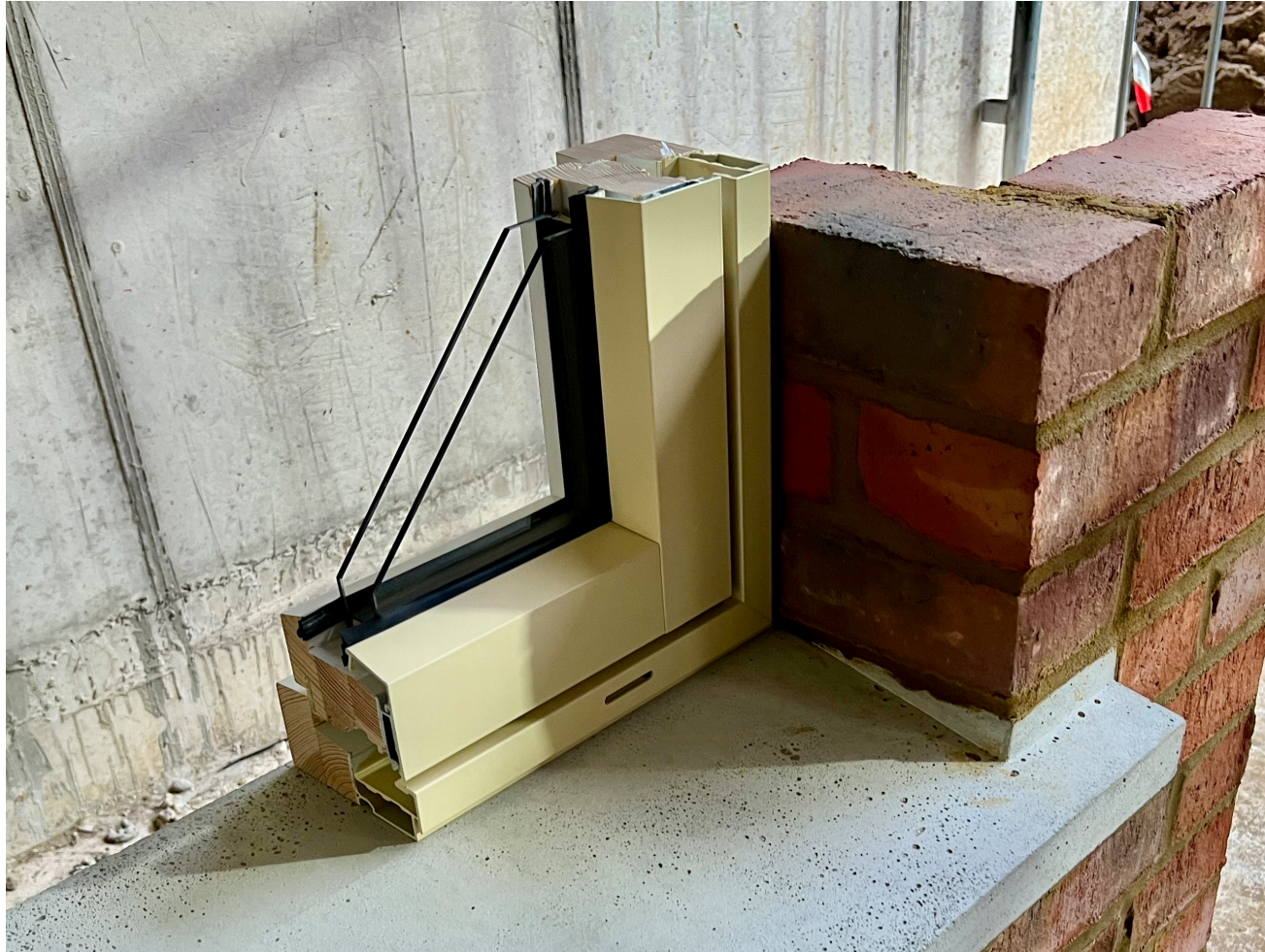
Window Sample set into brickwork on sill Image 01