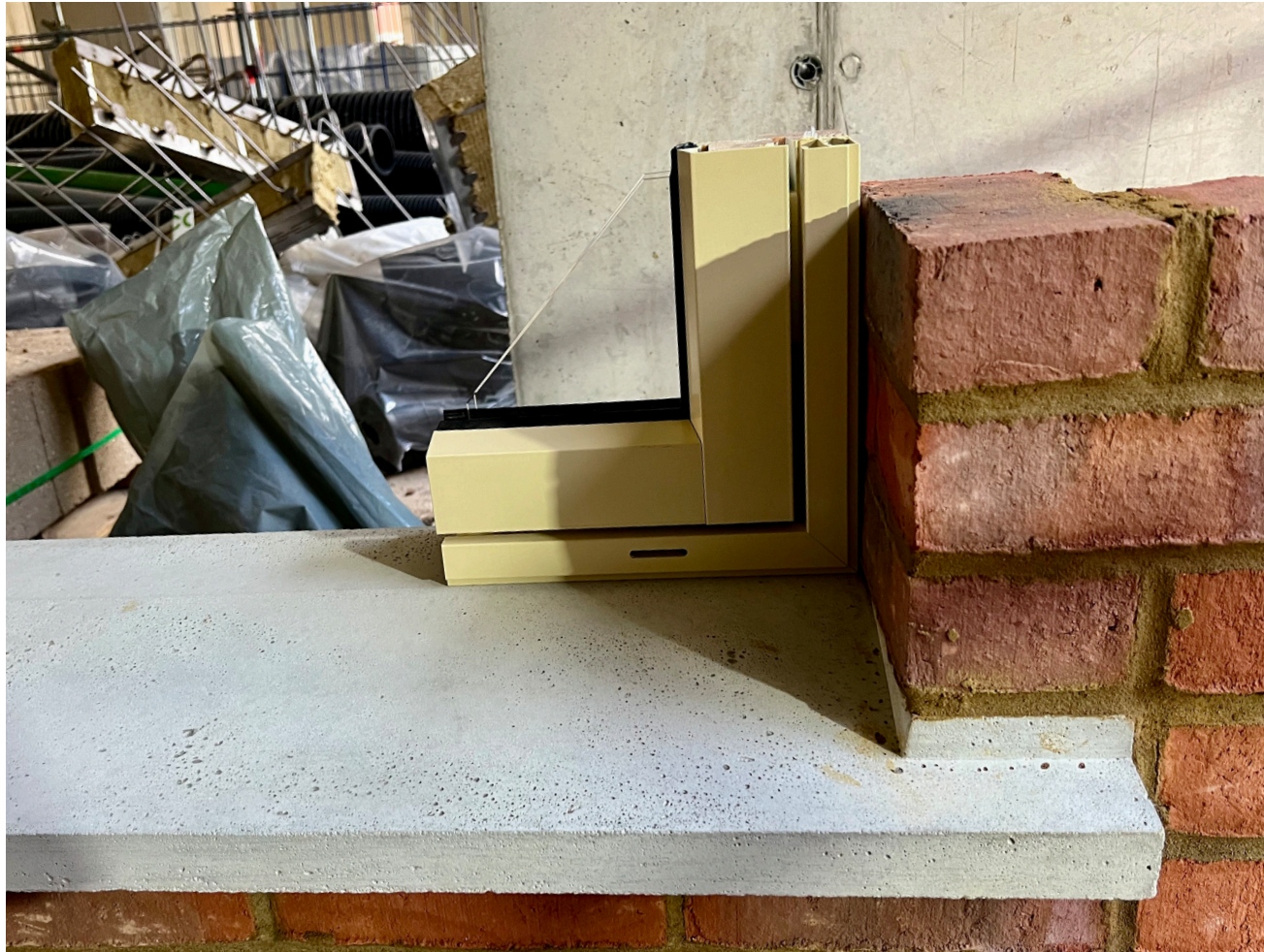
Window Sample set into brickwork on sill Image 01