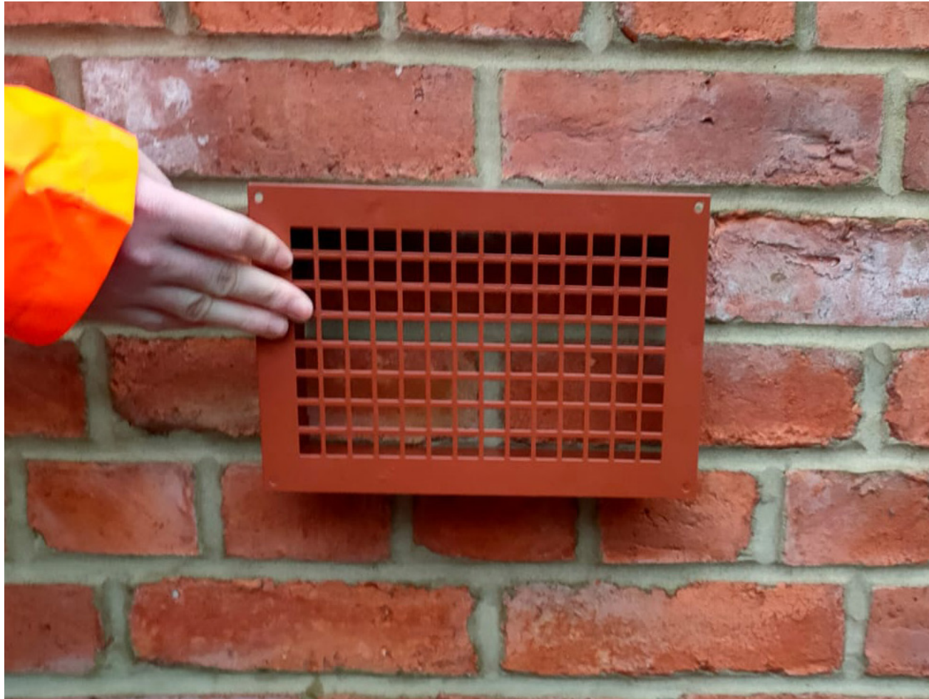
Air Brick Sample against Brickwork