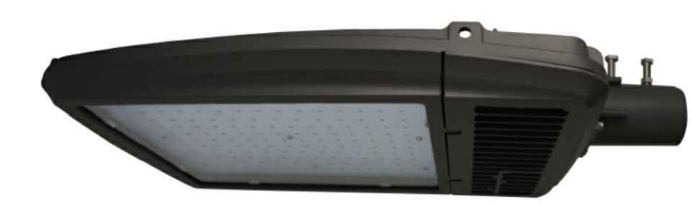
CAR PARK/STREET LIGHTING LANTERN, EDGE LIGHTING "PARQ AREA AF 840" 299mm x 240mm x 92mm (MINI SIZE)