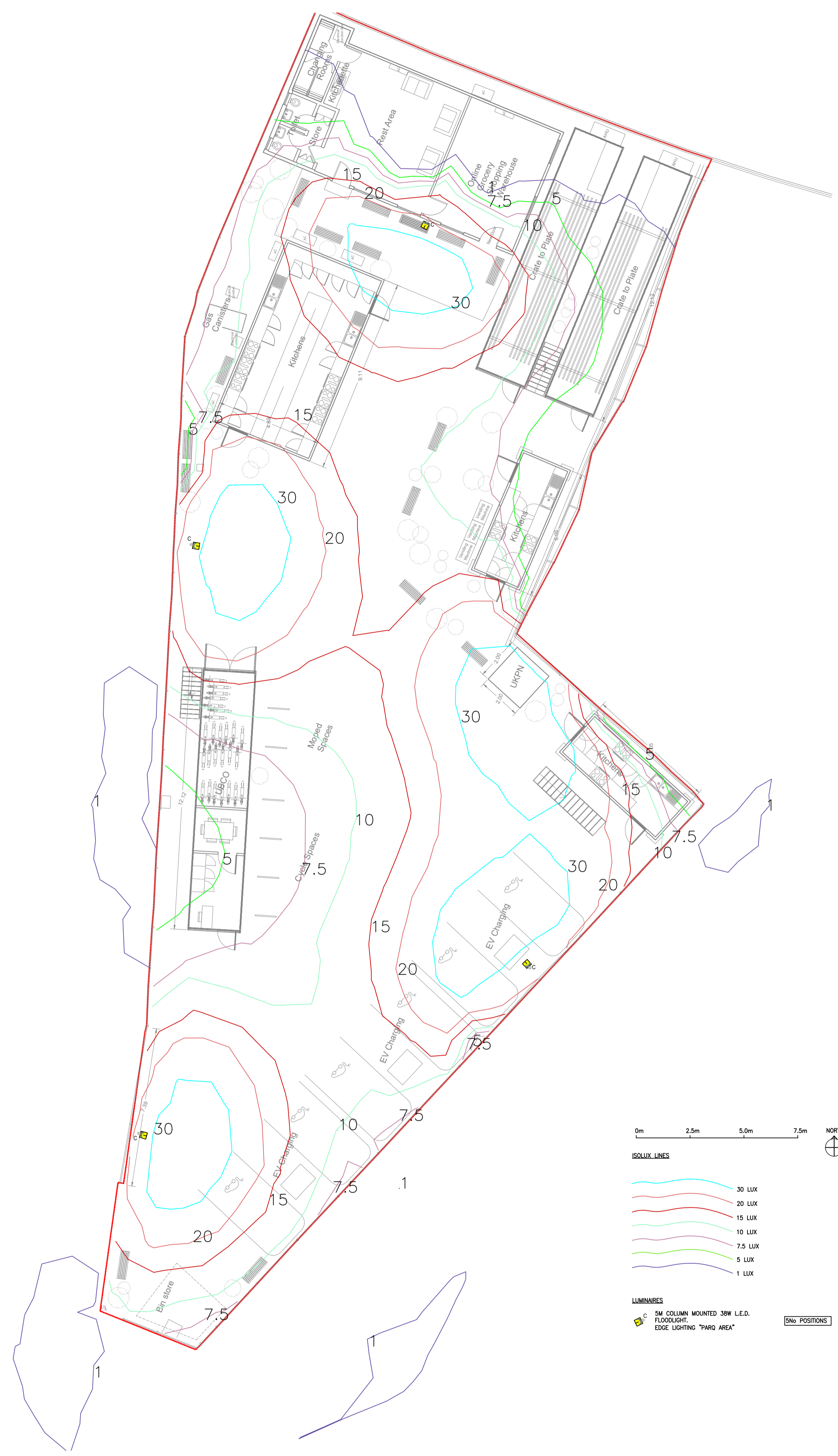
ISOLUX PLOT (1:125 @ A1) (ALL LUMNAIRES SWITCHED ON)