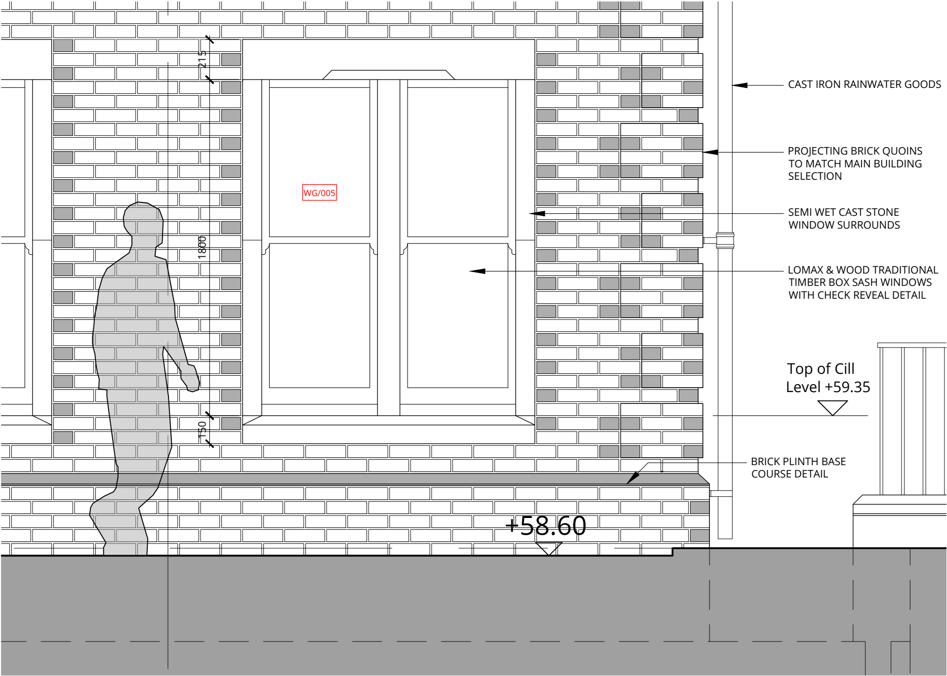
Proposed Partial Front Elevation - Brick Setting Out Scale 1:20