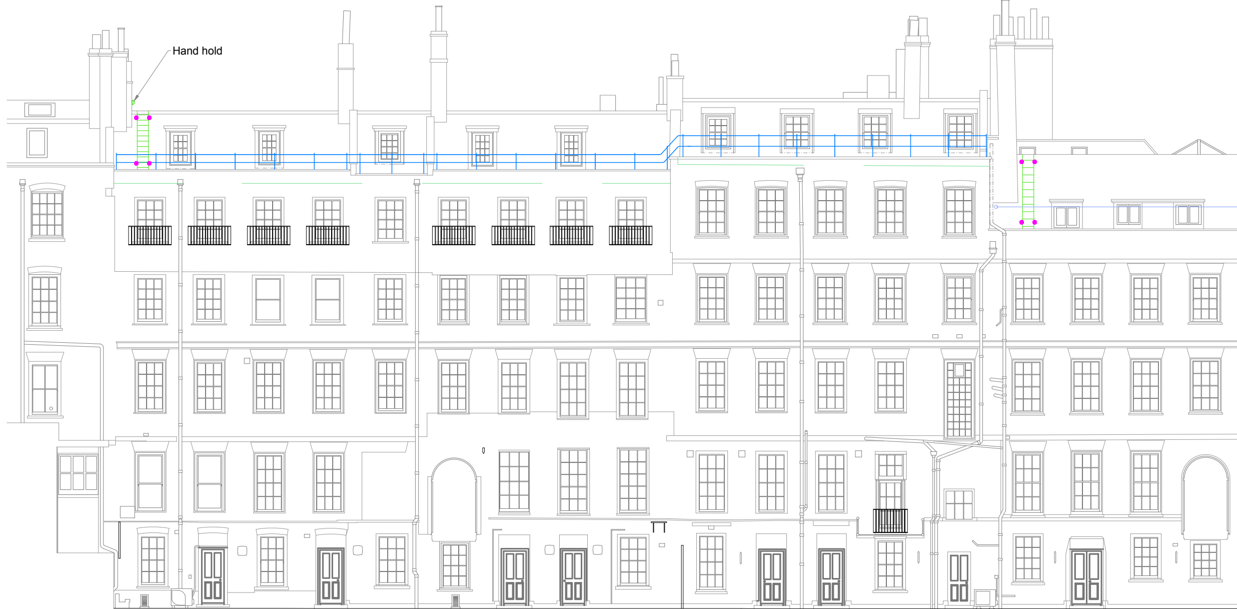
4. Front elevation Not to scale