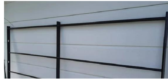
2. Image shown typical fall-arrest guard rail