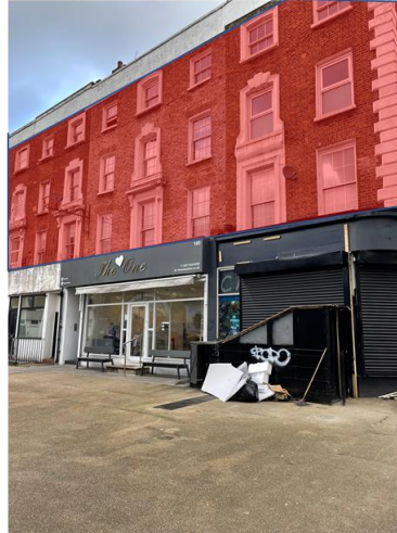
Red indicates residential immediately above and some of the nearby residential