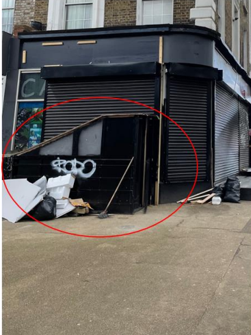
Poor Quality Entrance

The images below show the location and current condition of the entrance.