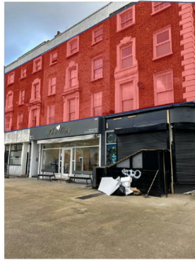
Red indicates residential immediately above and some of the nearby residential