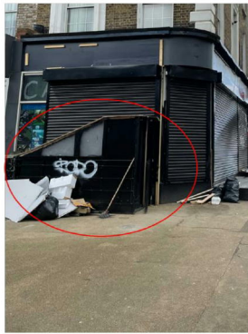
Poor Quality Entrance

The images below show the location and current condition of the entrance.