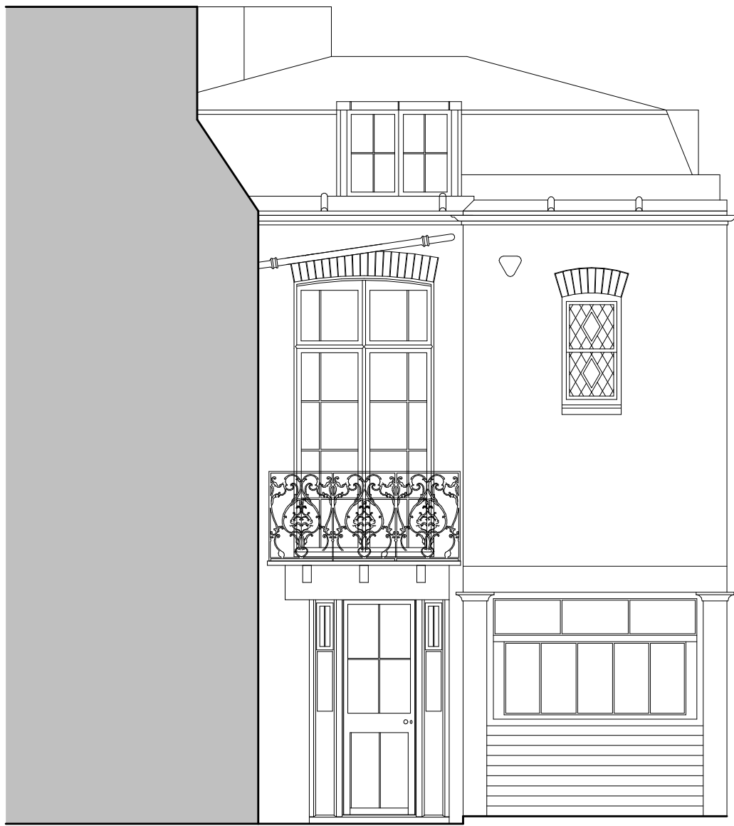
Rear Elevation (1:50)