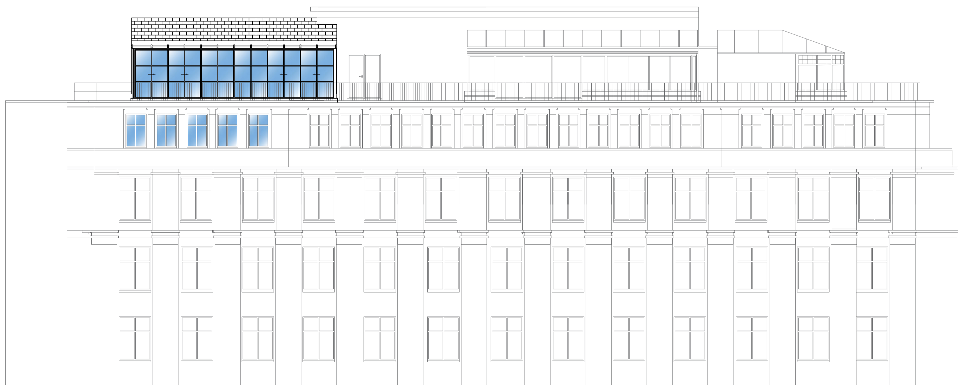
PART PROPOSED BEDFORD WAY ELEVATION