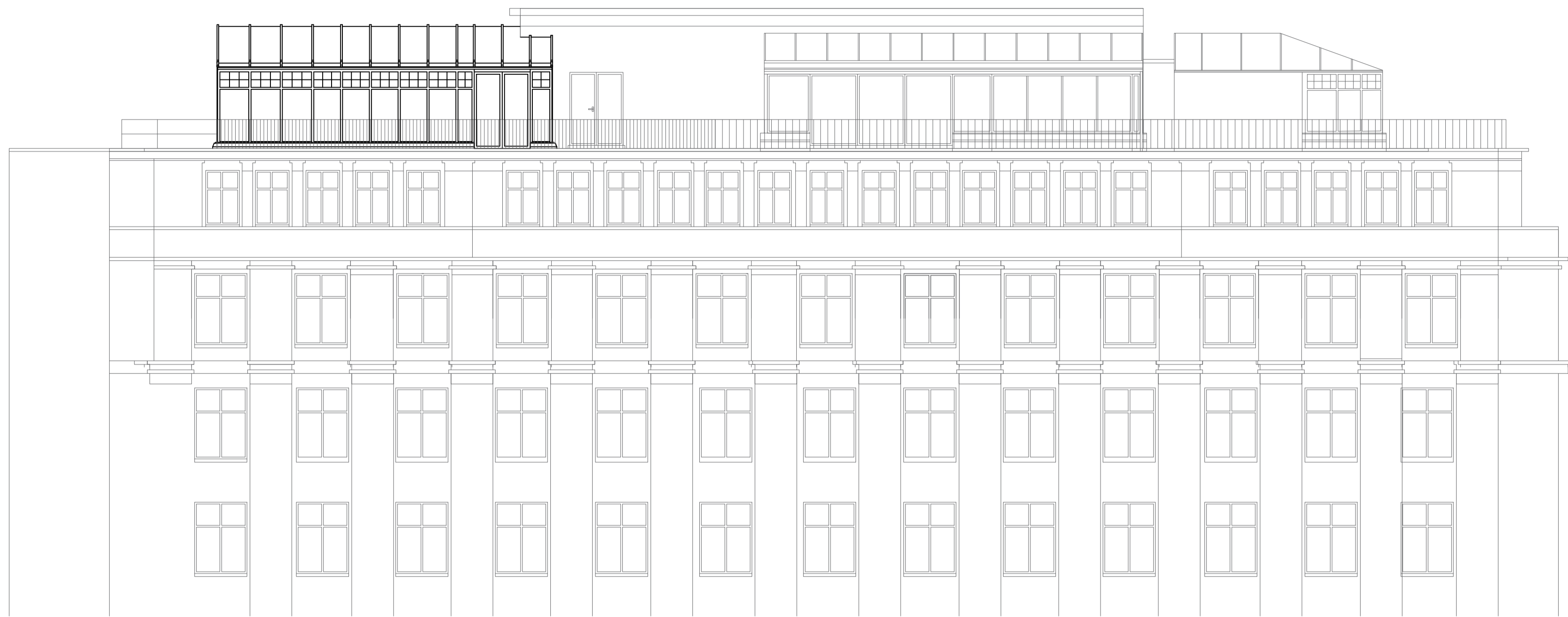
PART EXISTING BEDFORD WAY ELEVATION