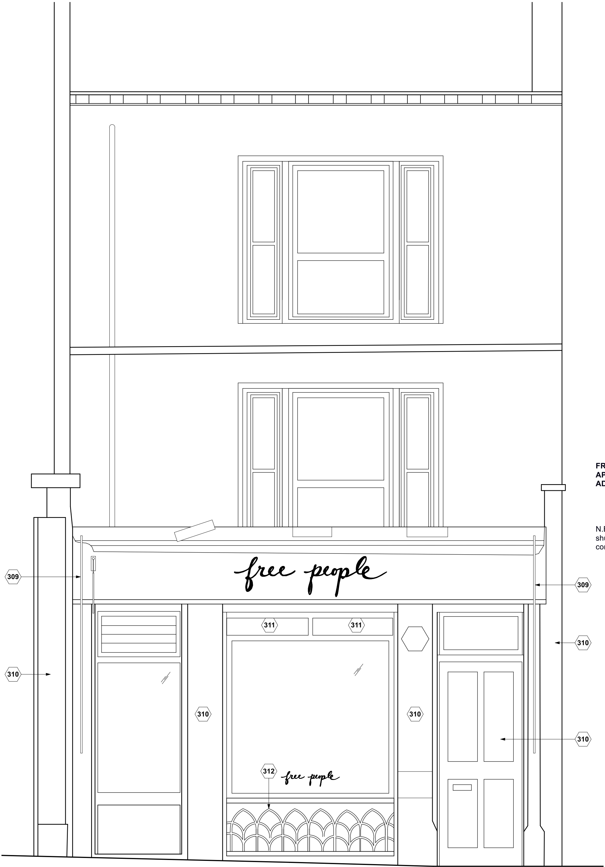
2 PROPOSED STOREFRONT ELEVATION PL303 SCALE: @A1 1:25