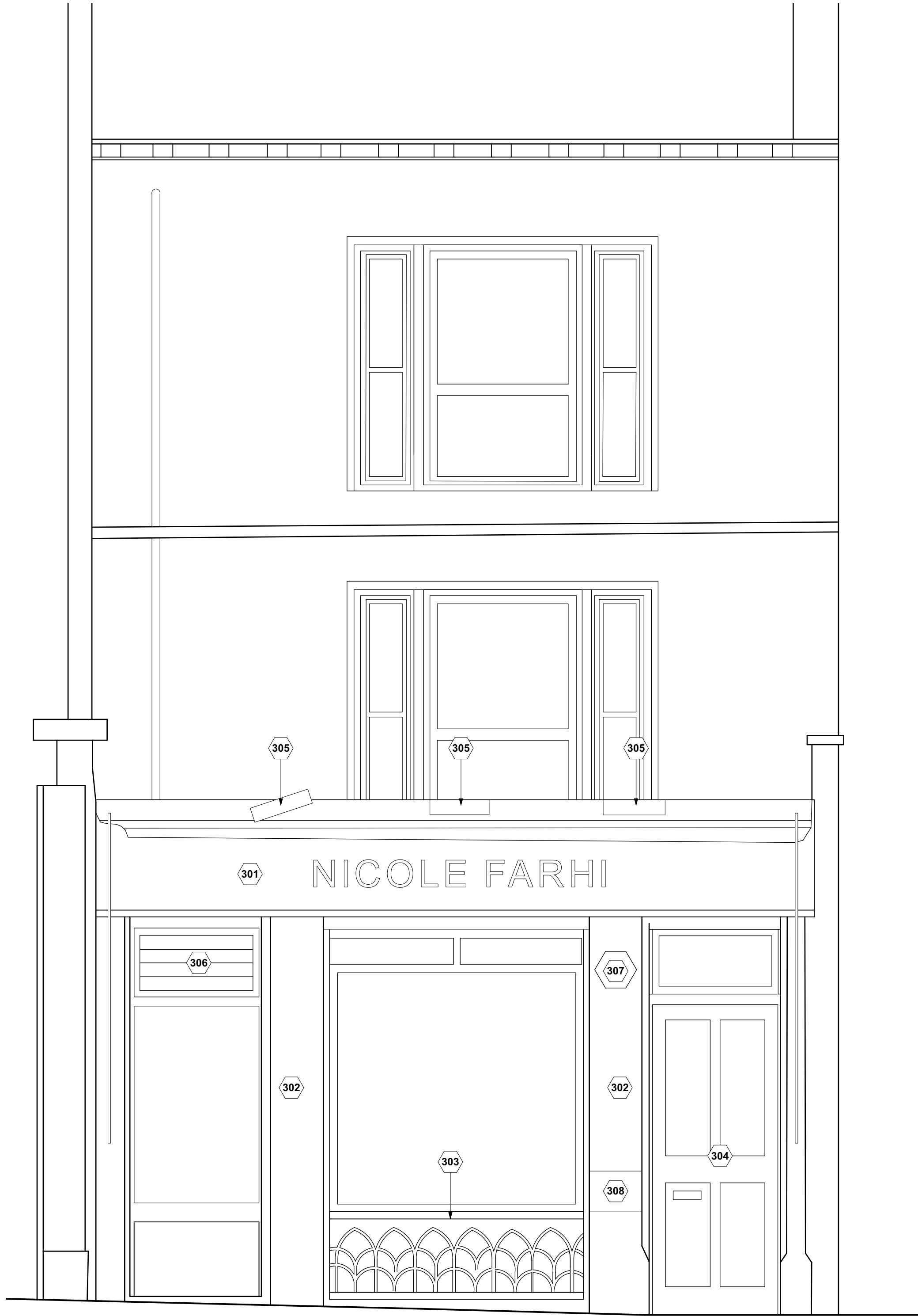
1 EXISTING STOREFRONT ELEVATION PL303 SCALE: @A1 1:25