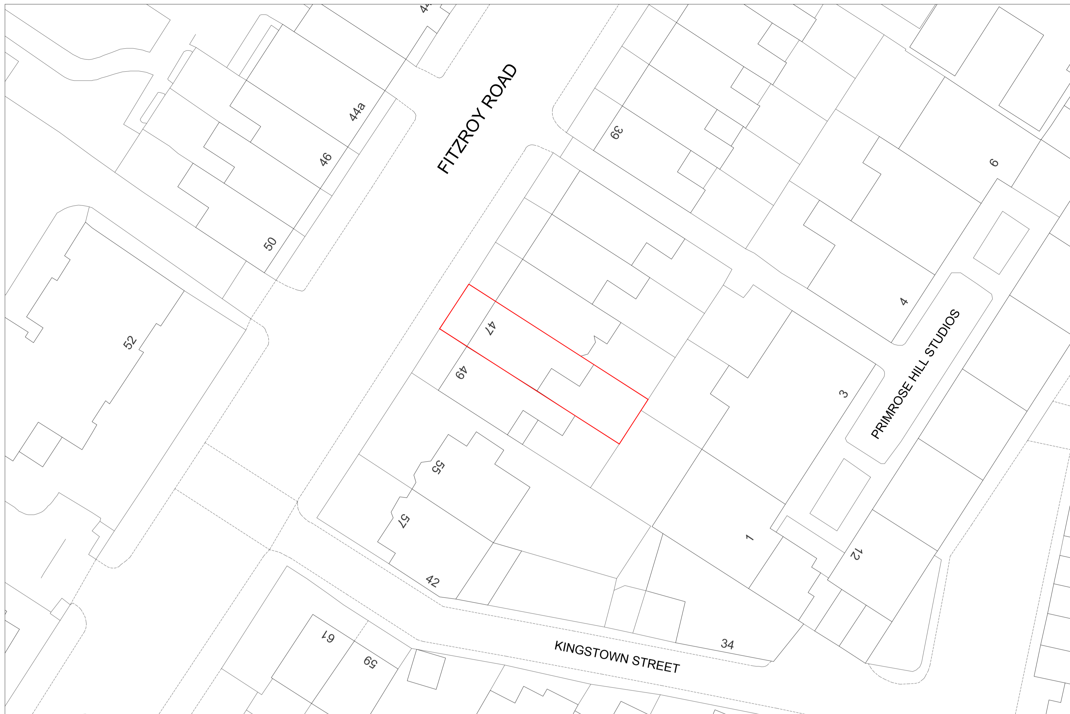
Site | Block Plan 1:500 @ A3 | 1:250 @ A1