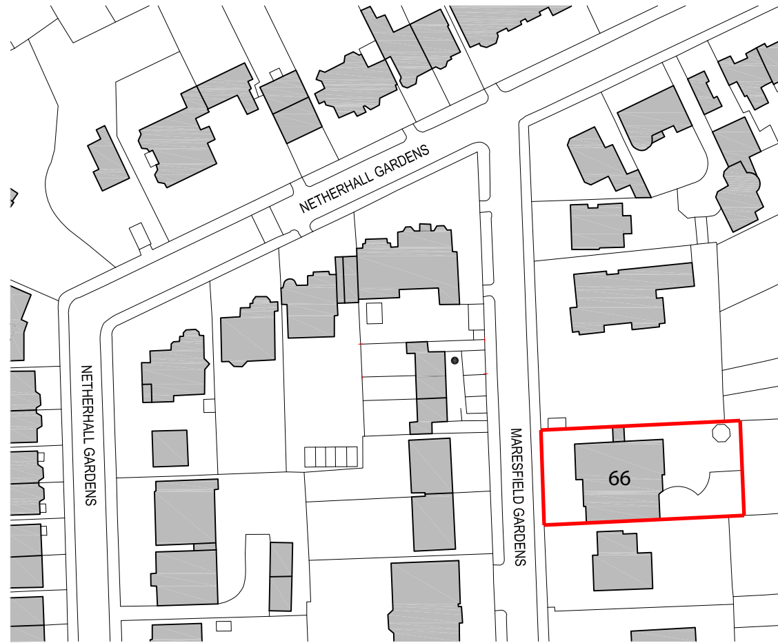
SCALE 1:1250 SITE LOCATION PLAN