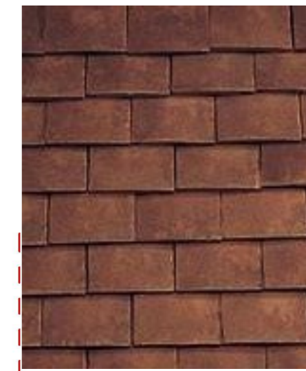
Example of new handmade Keymer Goxhill tiles