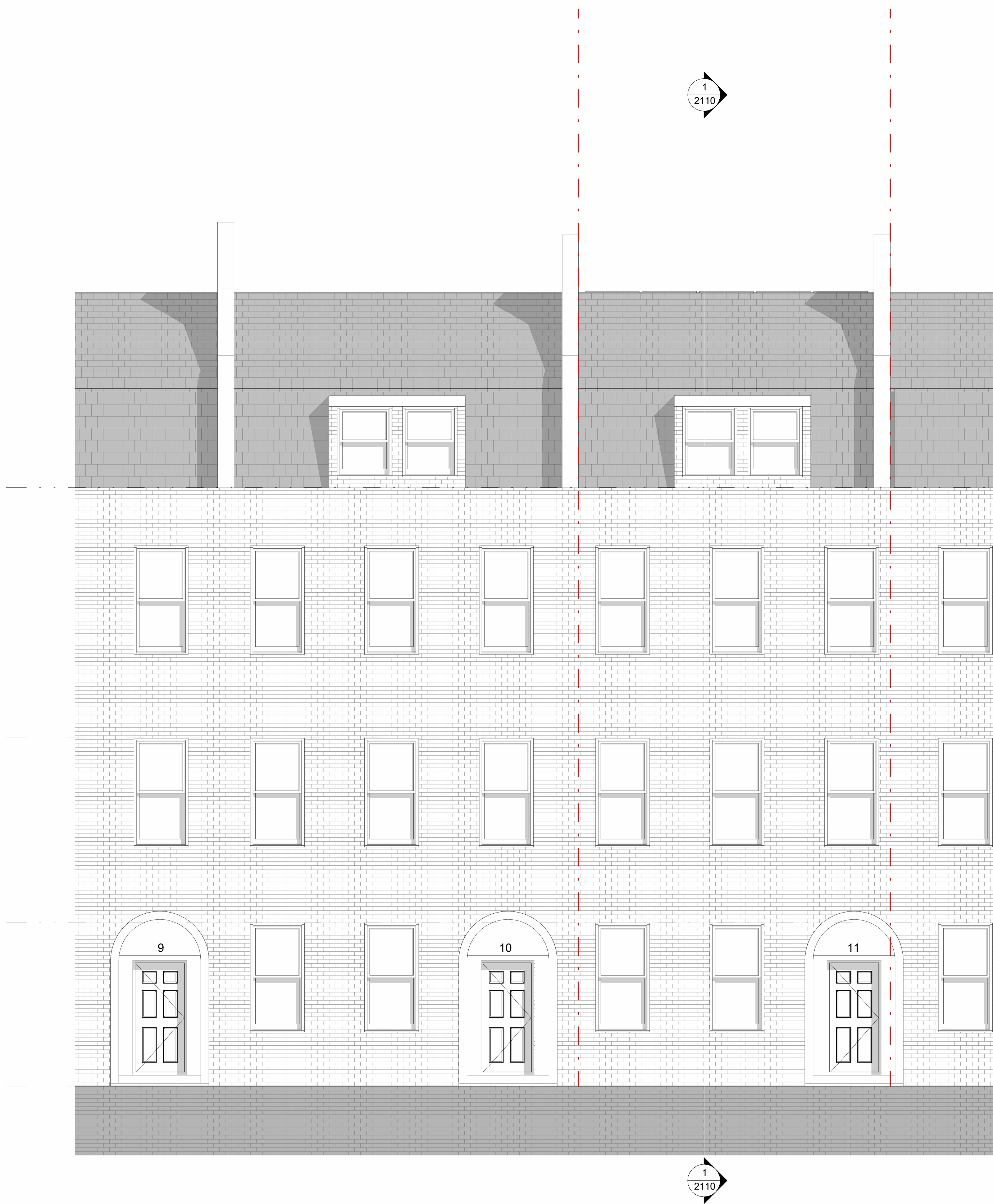
1 No. 11 North East Elevation - Proposed 1:50