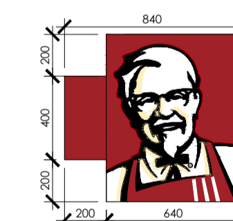
existing projection sign scale - 1:25 @ A1 / 1:50 @ A3

RETAIN, CLEAN AND MAKE GOOD EXISTING PROJECTING SIGN. RELAMP IF REQUIRED.