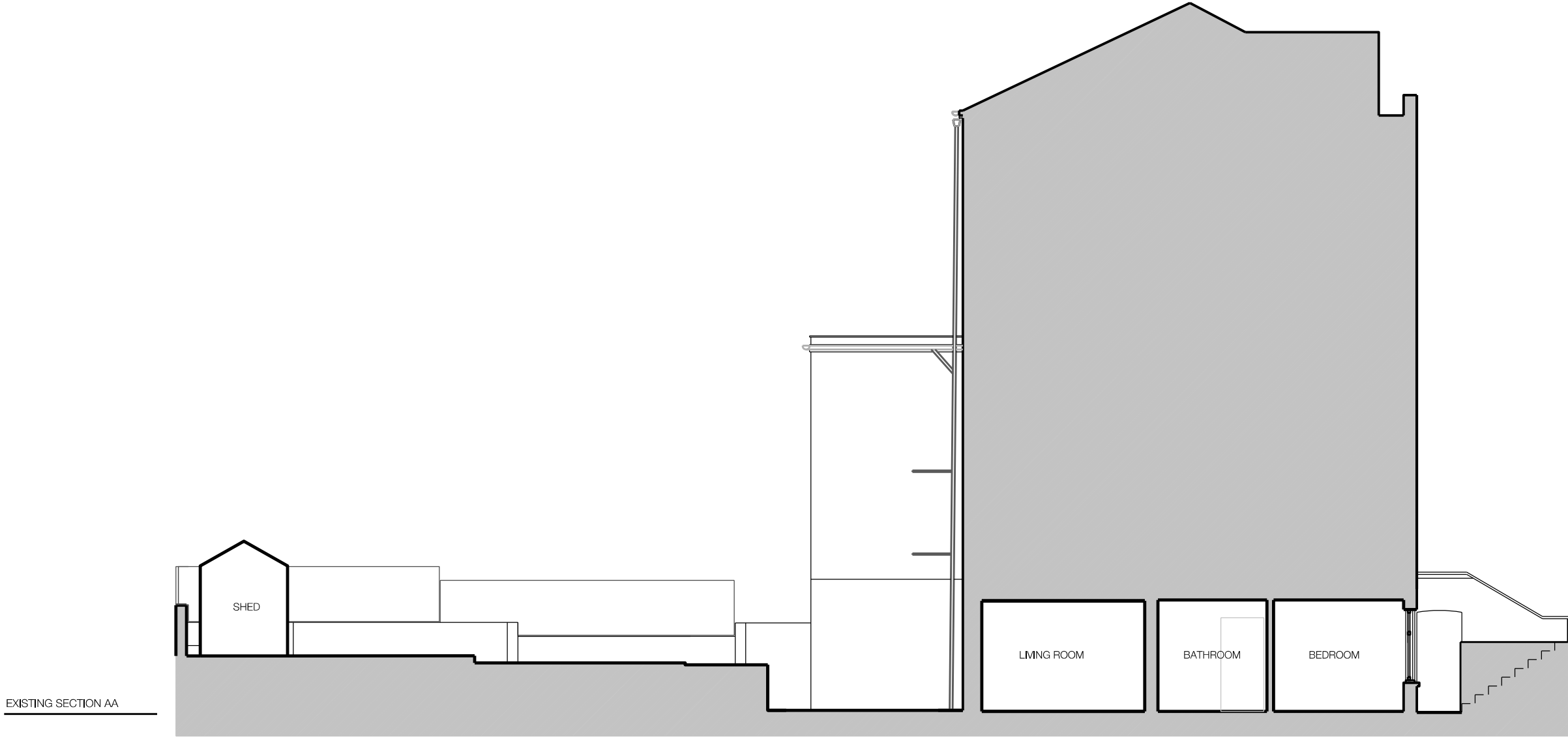
EXISTING SECTION AA