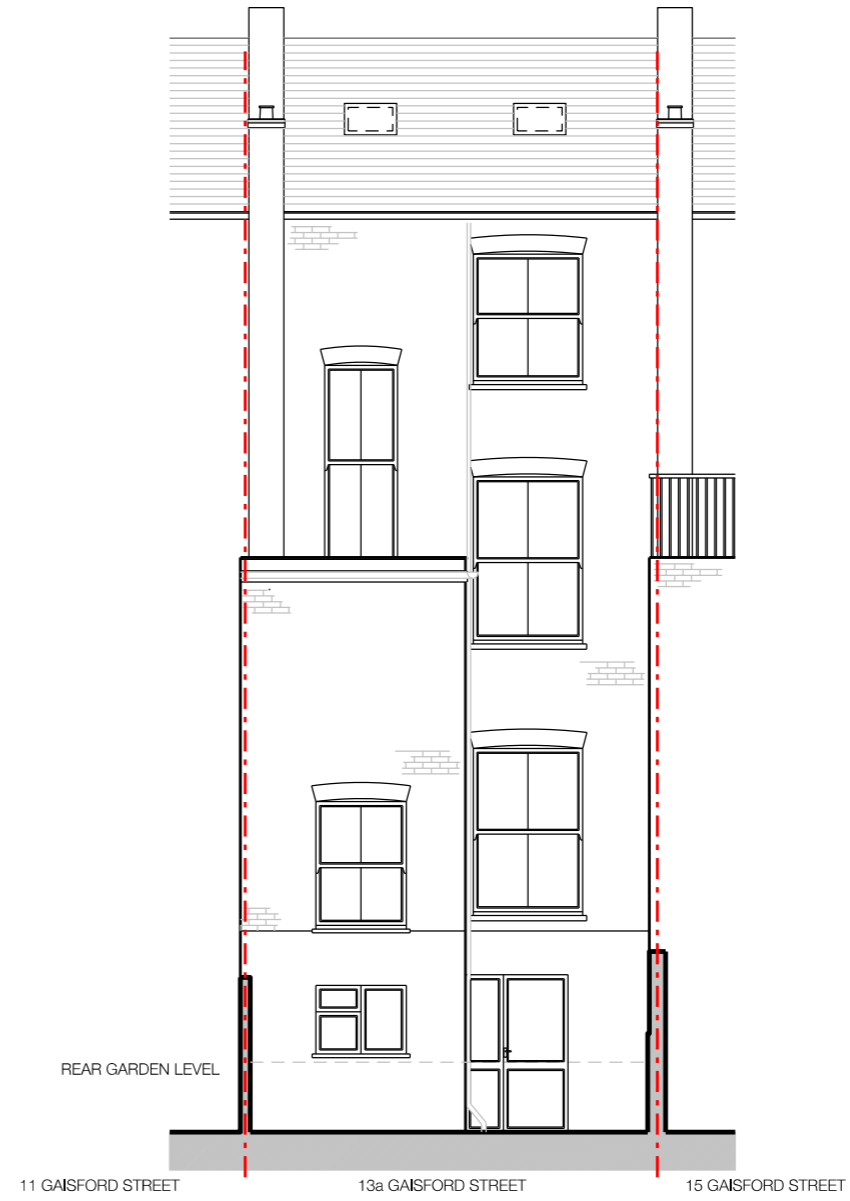
EXISTING SOUTH FACING ELEVATION