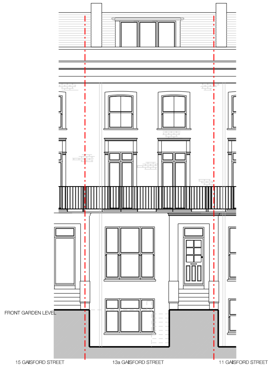
EXISTING NORTH FACING ELEVATION