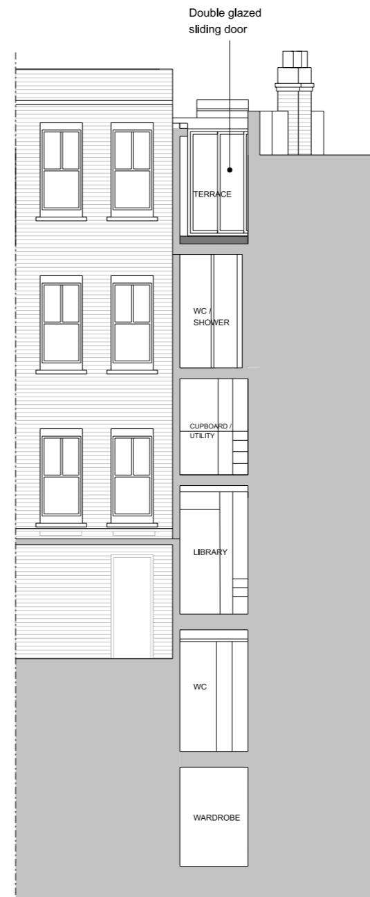
REAR ELEVATION 02