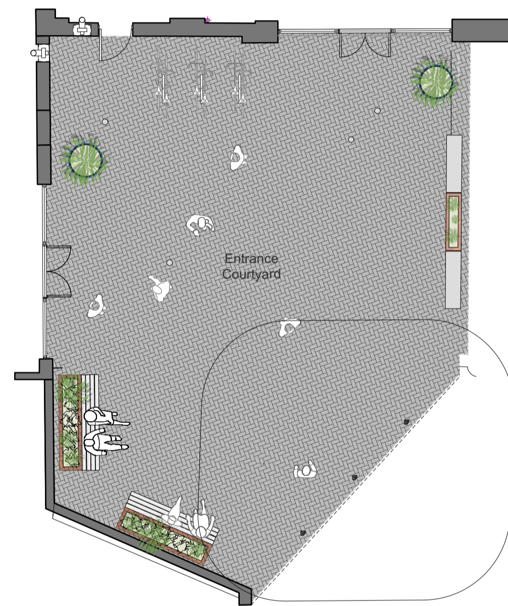
3 Key Plan