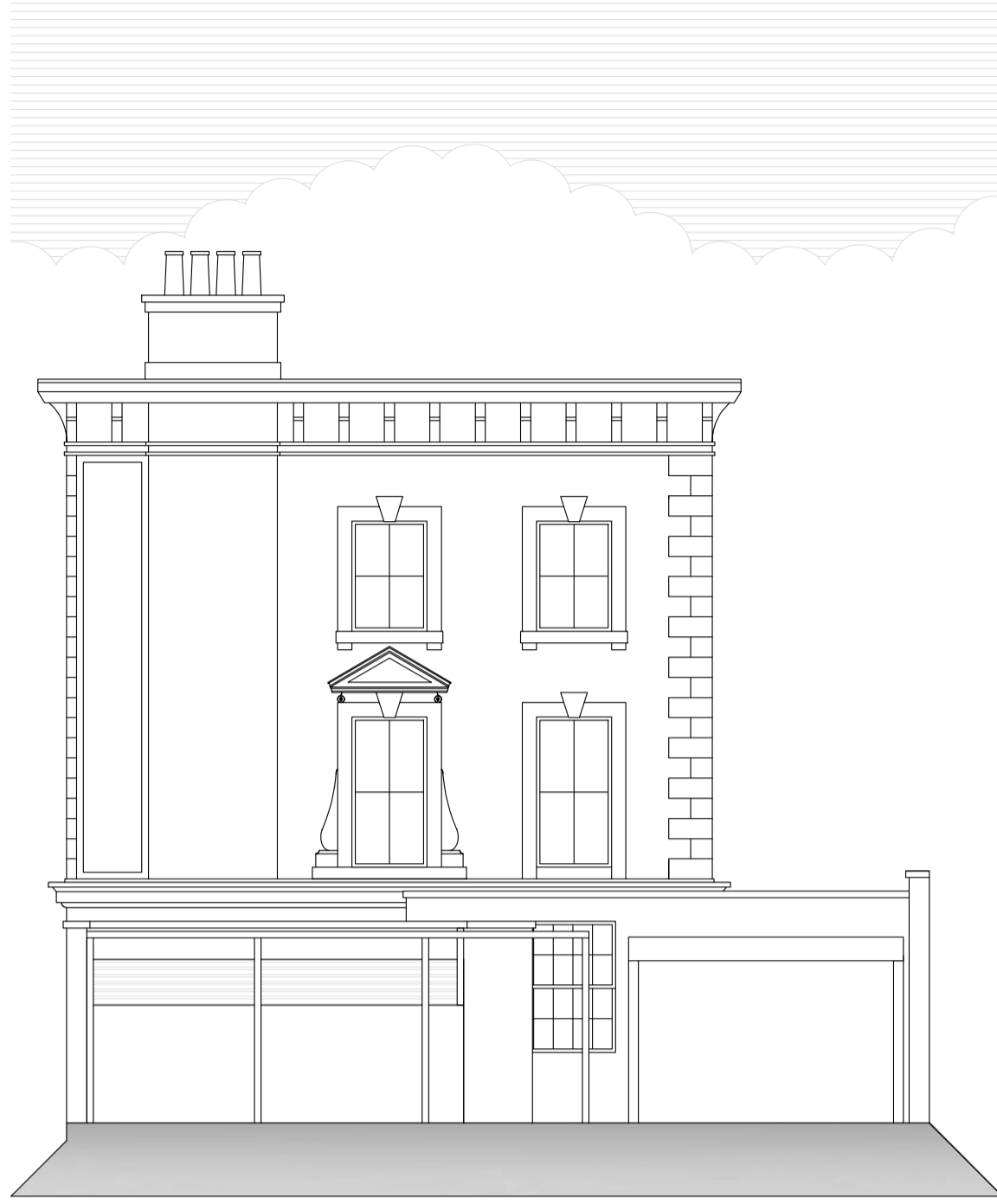
Proposed Rear Elevation 1:100