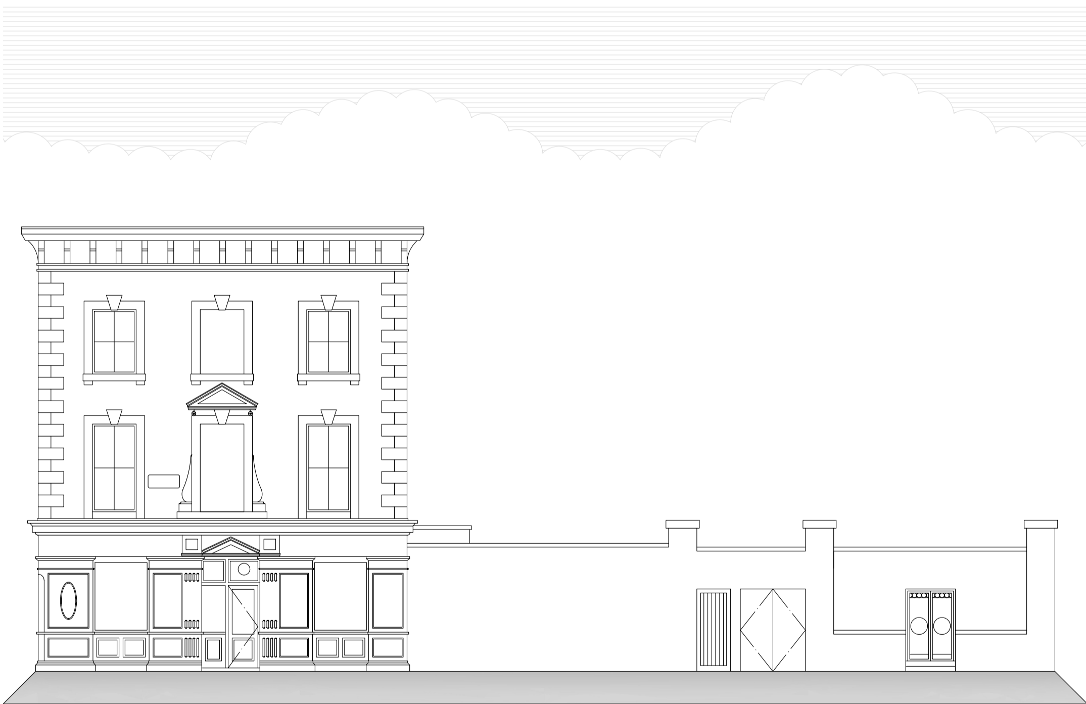
Existing Side Elevation 1:100