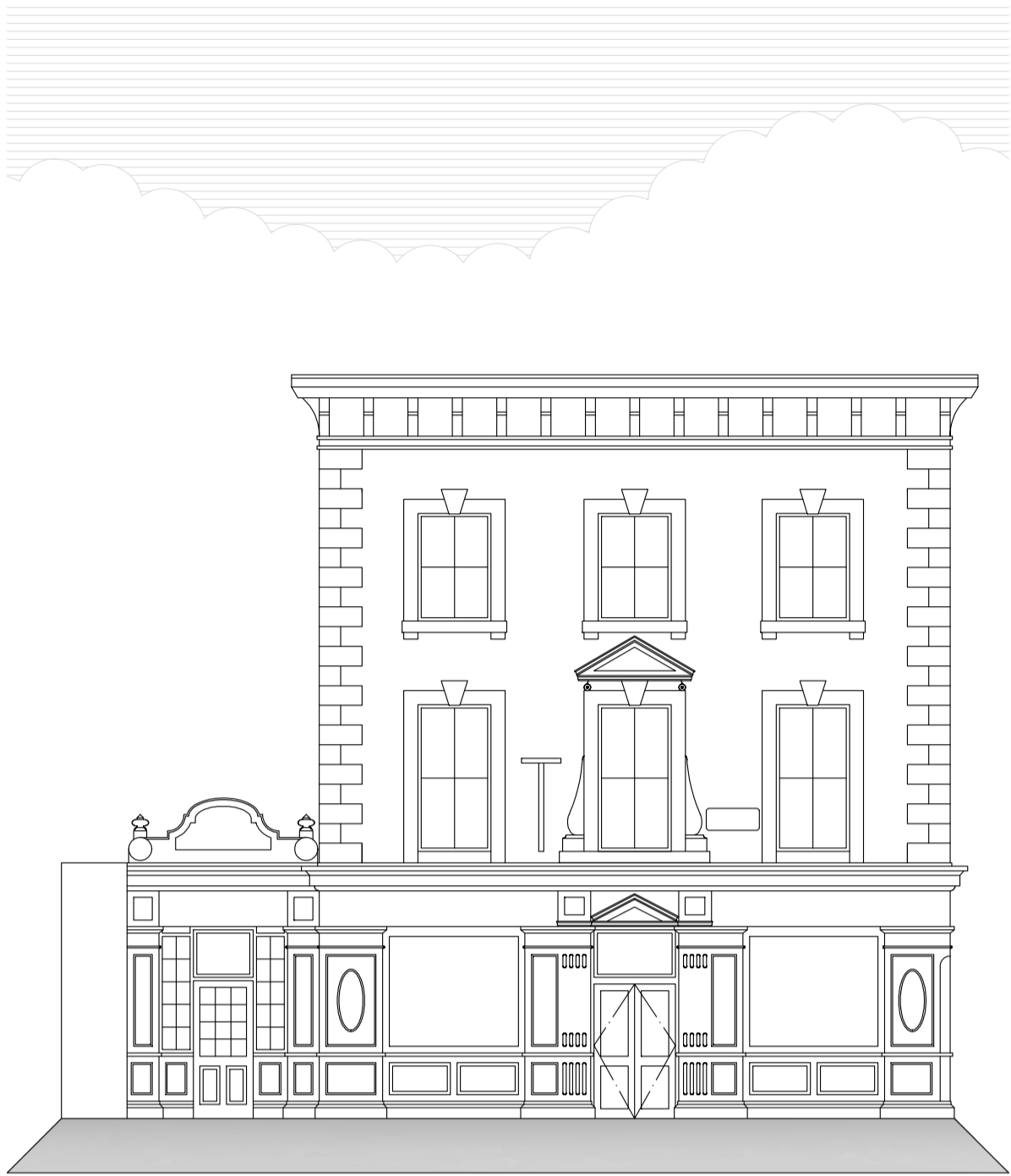
Existing Principal Elevation 1:100