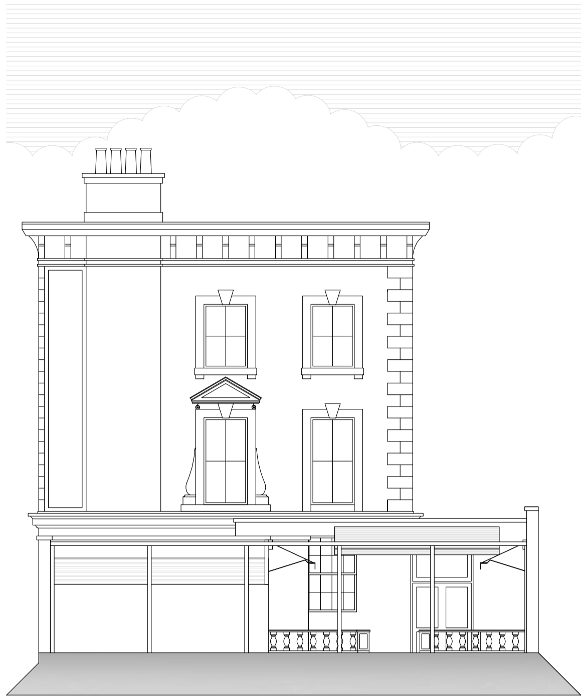
Existing Rear Elevation 1:100