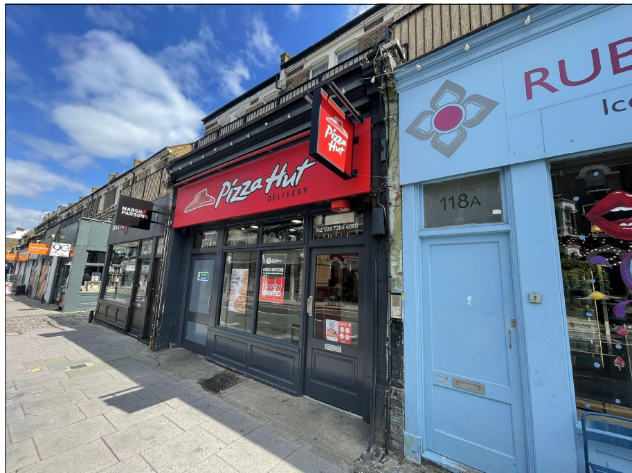
02 Photograph of Existing Shopfront Not To Scale