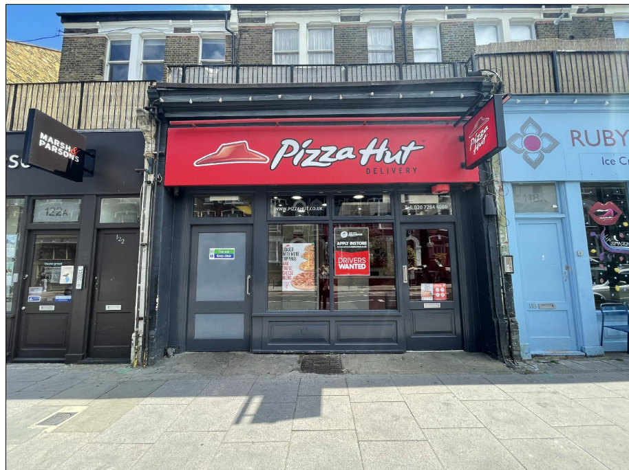
01 Photograph of Existing Shopfront Not To Scale