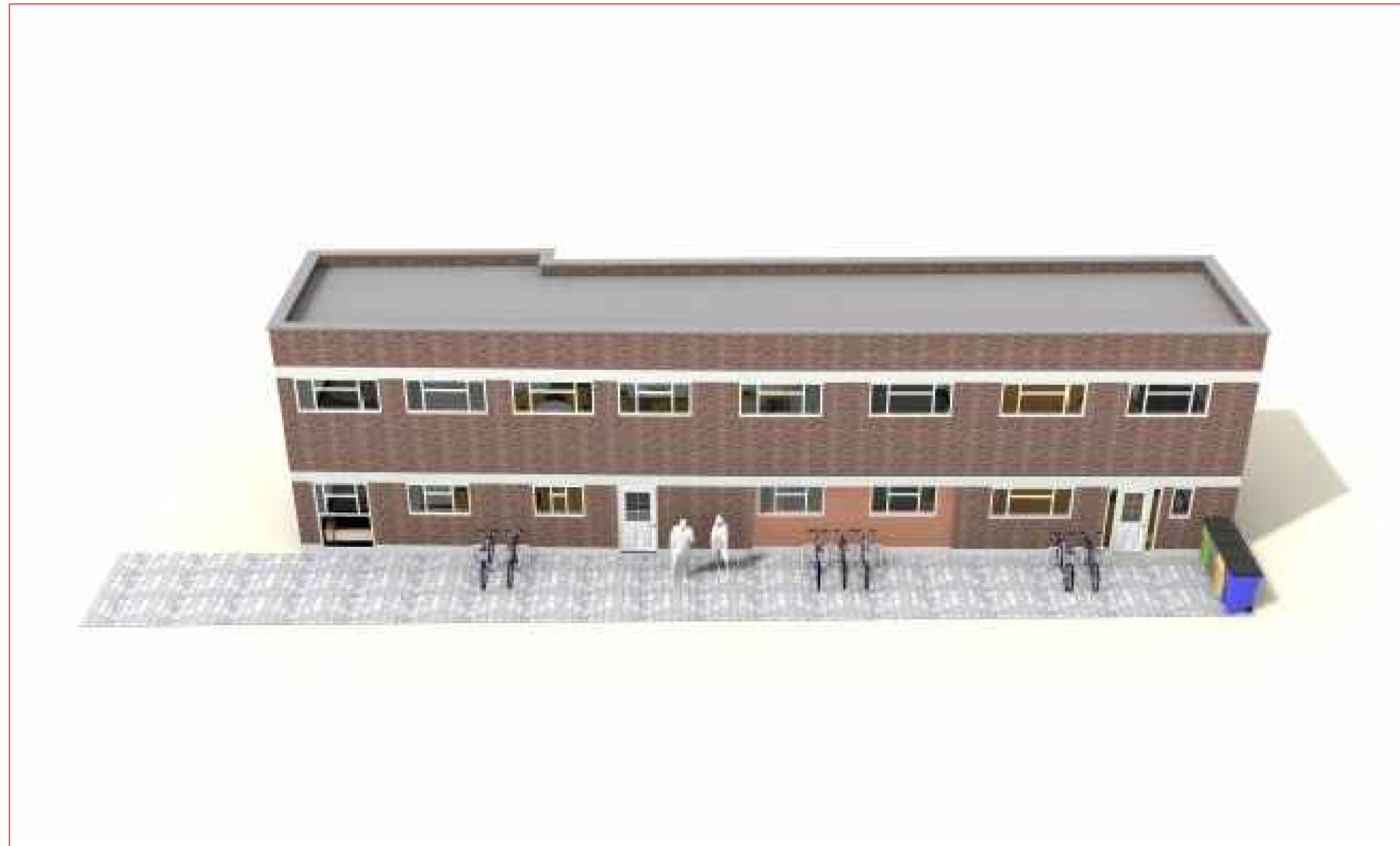
Proposed Front Elevation-South/East