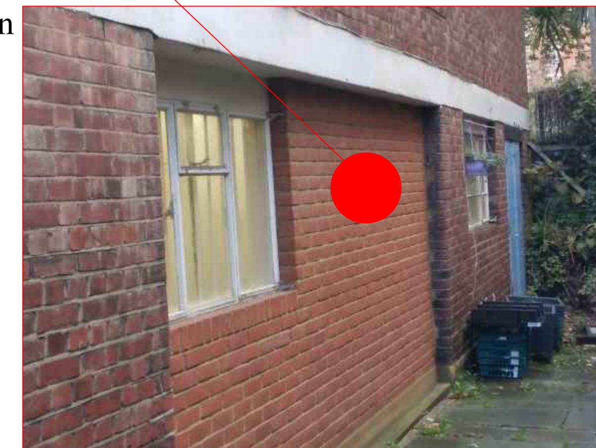
Proposed Position of New Window

Registered as an Architect under the Architect Act 1997