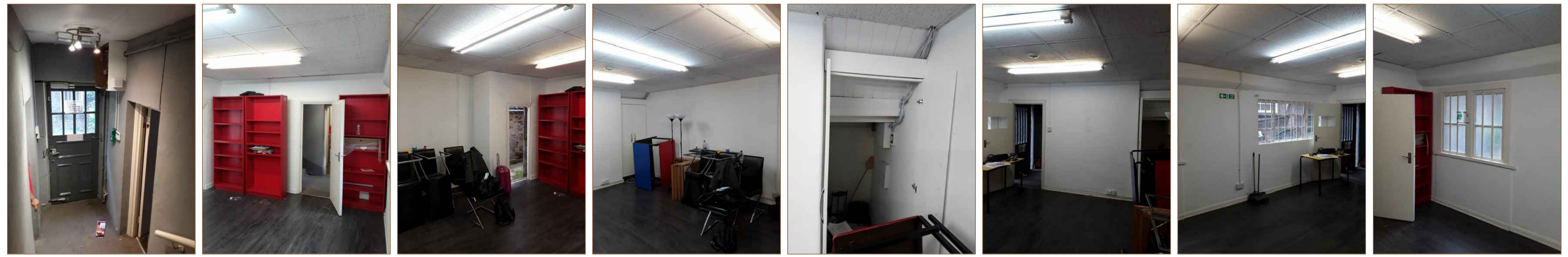
VIEW N. 14 VIEW N. 15 VIEW N. 16 VIEW N. 17 VIEW N. 18 VIEW N. 19 VIEW N. 20 VIEW N. 21