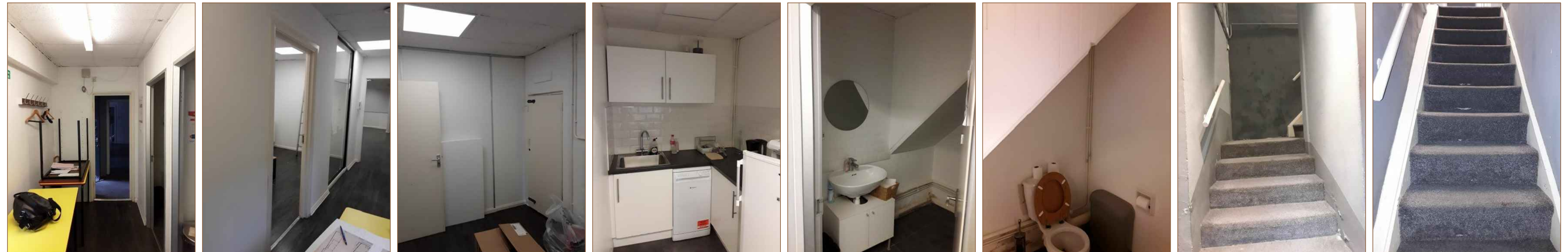
VIEW N. 6 VIEW N. 7 VIEW N. 8 VIEW N. 9 VIEW N. 10 VIEW N. 11 VIEW N. 12 VIEW N. 13