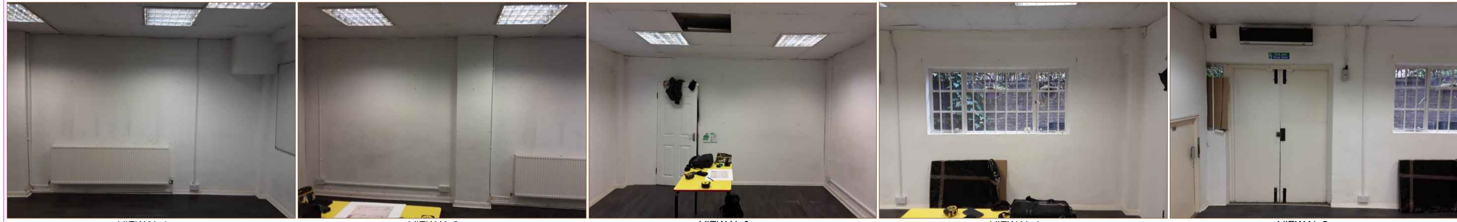
VIEW N. 1 VIEW N. 2 VIEW N. 3 VIEW N. 4 VIEW N. 5

Project Code ASP-21105 Drawing No. P151 Revision 0