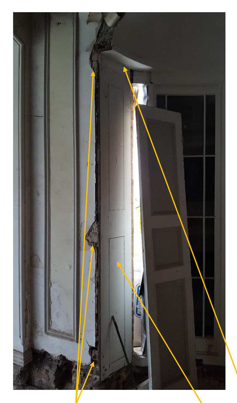
Photo 6. Note grounds set in wall, shutter box liner and soffit still in situ.