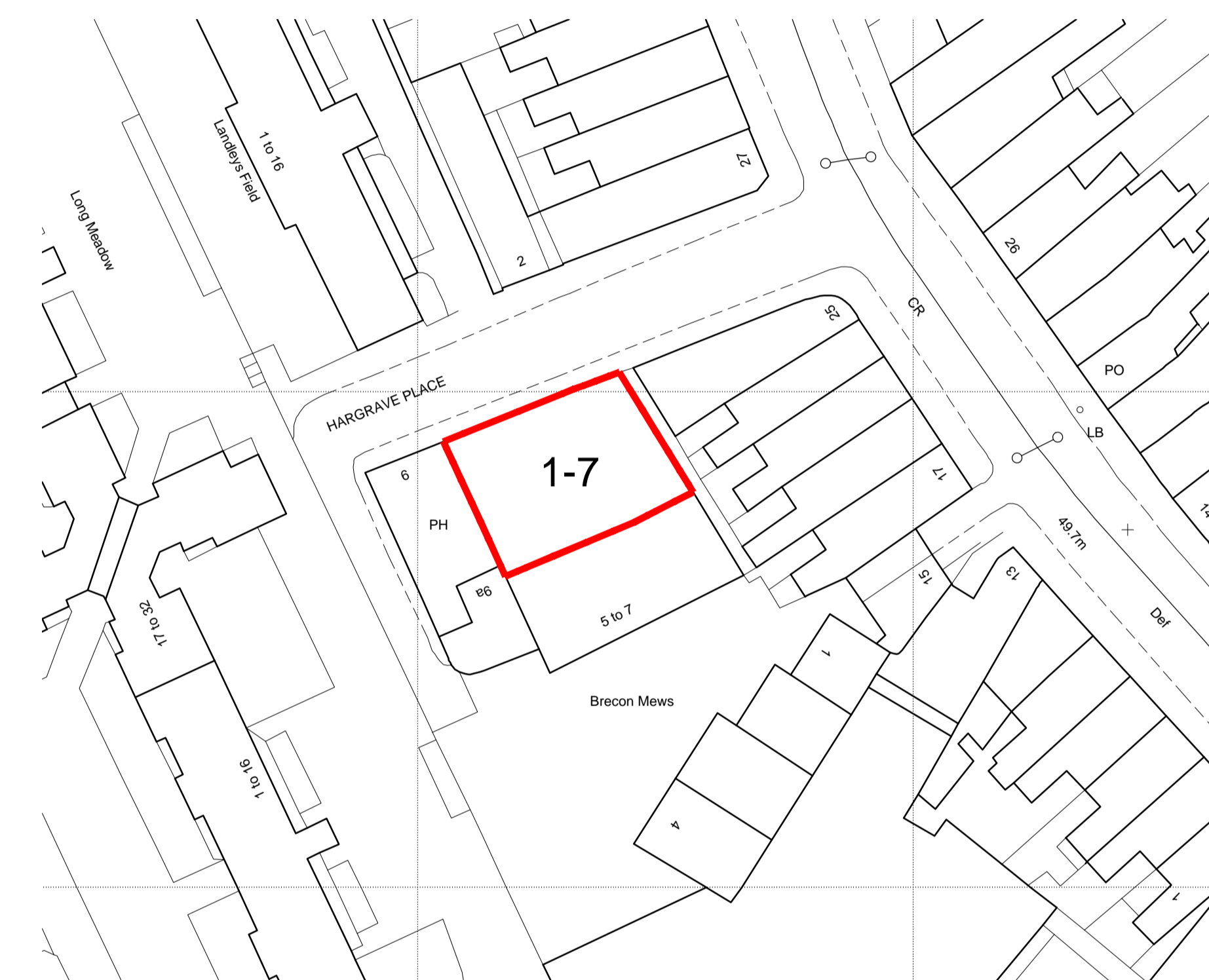
BLOCK PLAN 1:500