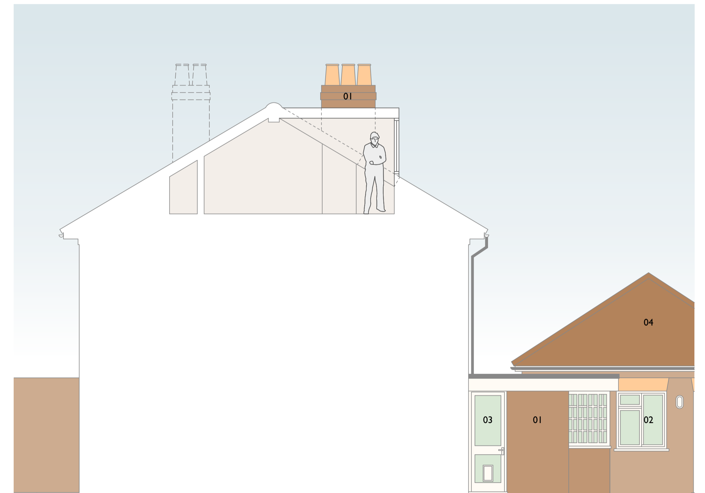
Cross Section/West Elevation