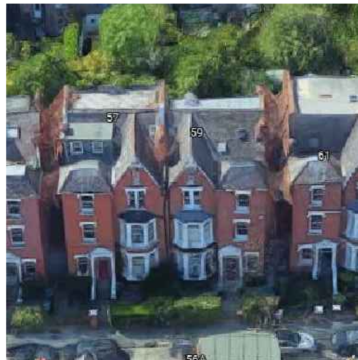
REAR AERIAL VIEW