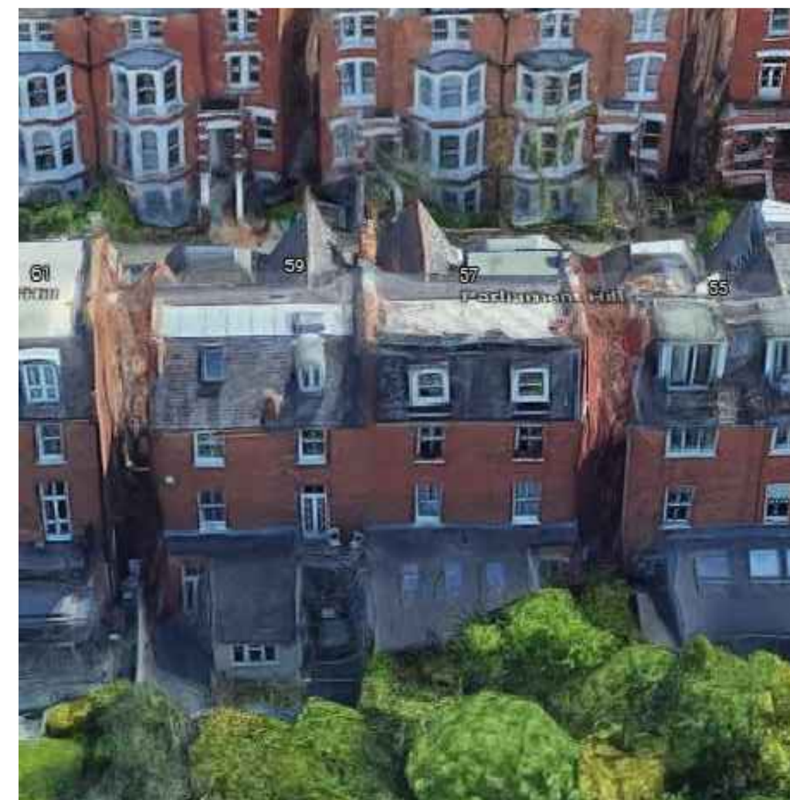
REAR AERIAL VIEW