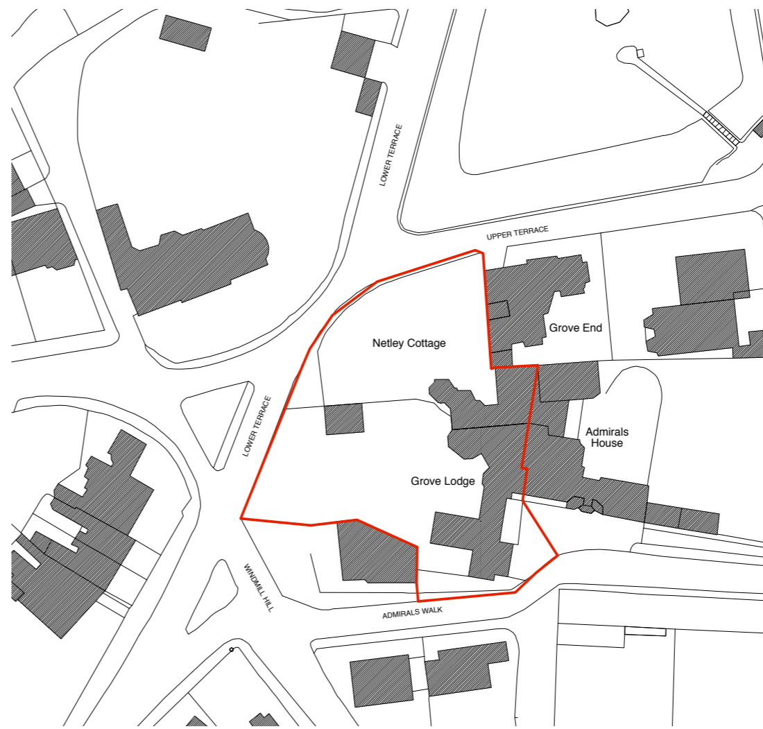
Site Plan 1:500