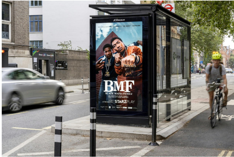
Foster and Partners shelter – Grays Inn Road

These applications are part of the Company's continuing effort to improve the function, design and technology applied to the Borough's transport infrastructure for the benefit of Camden residents and visitors.