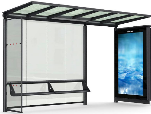
Illustration of the proposed Foster and Partners shelter with Integral Screen

The proposal seeks consent to replace the ADU's at each site with double sided LCD screens targeting pedestrians and vehicular traffic. The ADU remains an integral part of the bus shelter to which it is attached and in the same existing position 1 .