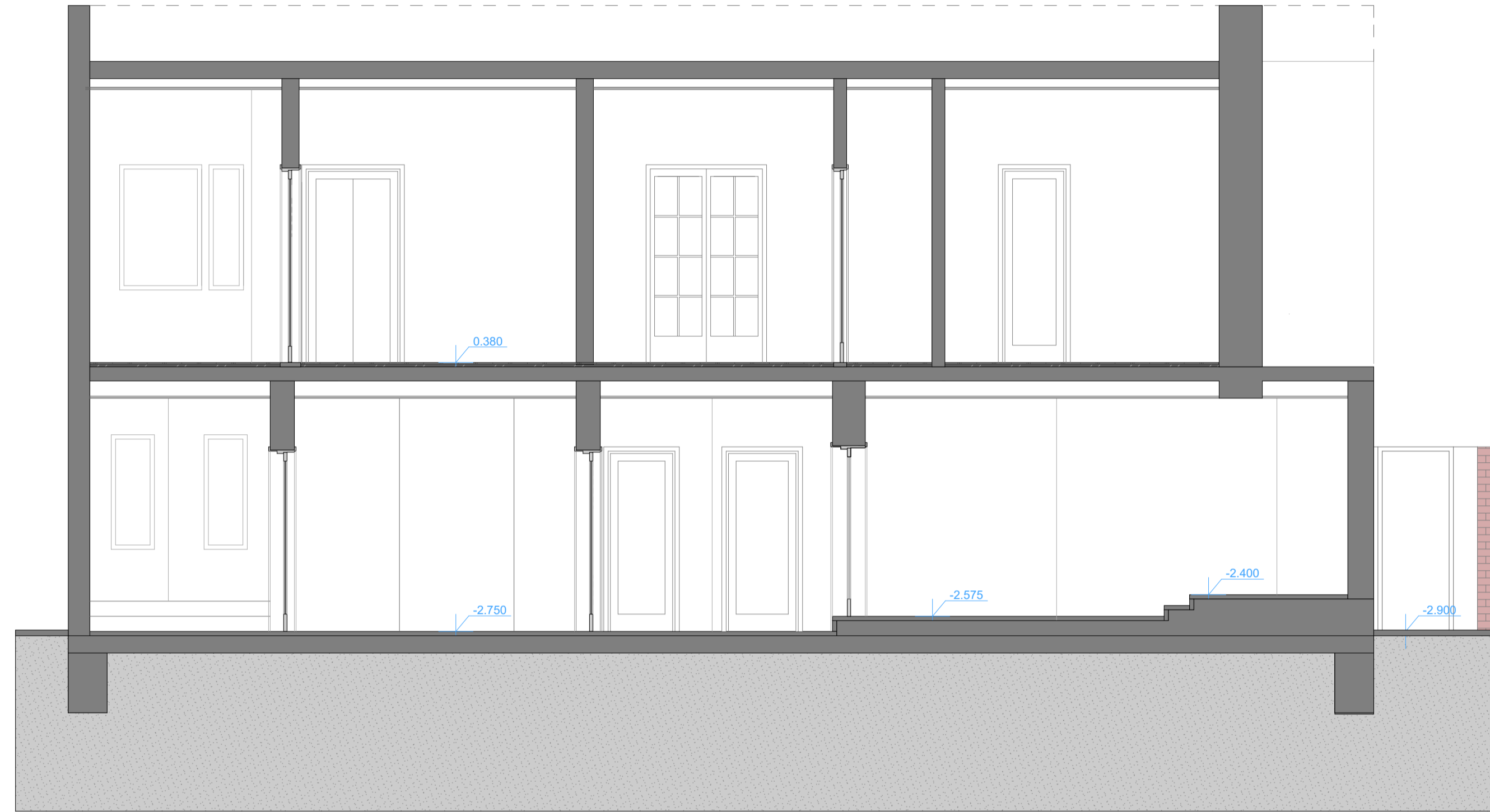
EXISTING - SECTION 2-2

attention! do not scale off this drawing! check all dimensions on site and advise any discrepancies before work commencing! © DARTEL DESIGN LIMITED