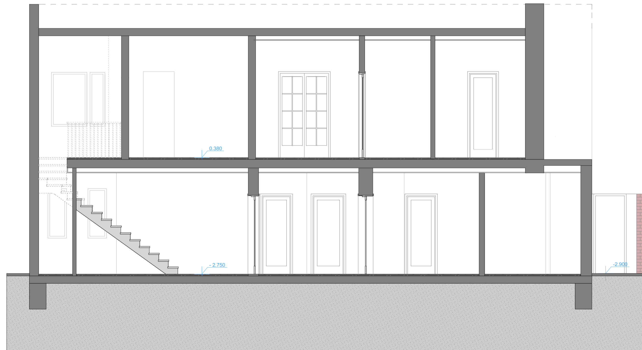
PROPOSED - SECTION 2-2