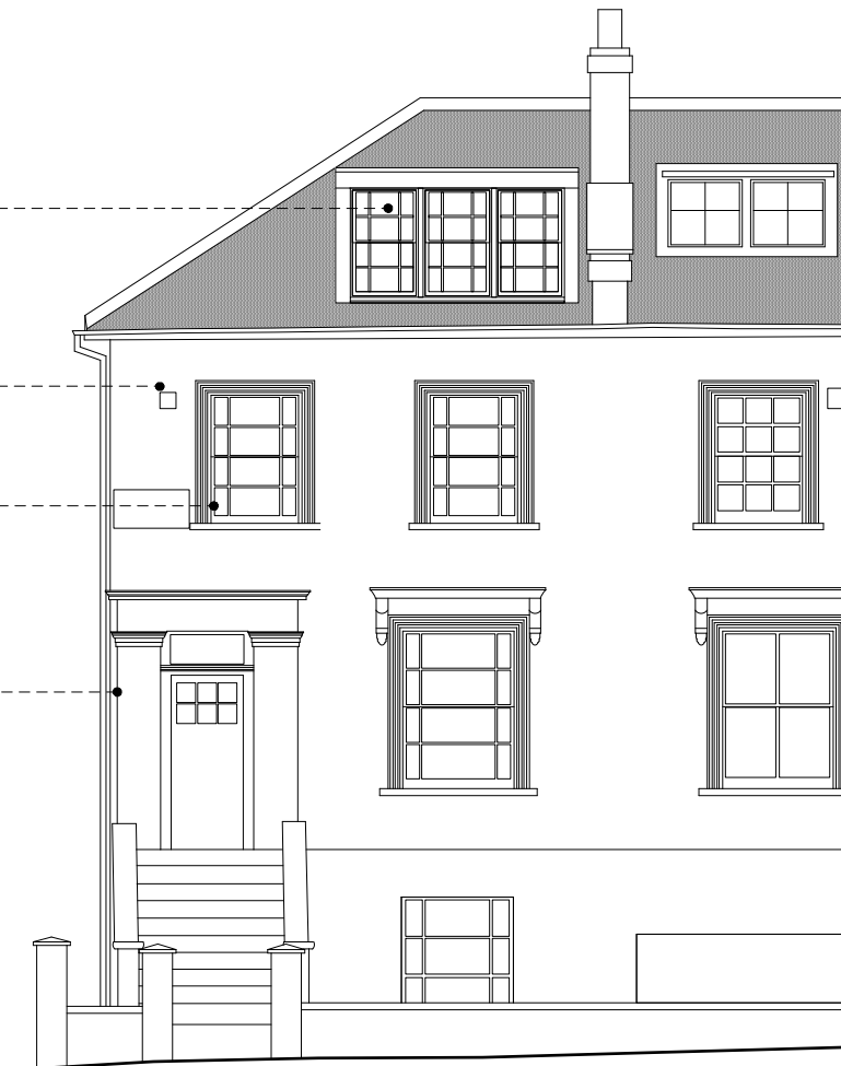
FRONT ELEVATION to Stratford Villas 1:100

Painted stucco door surround repaired and repainted