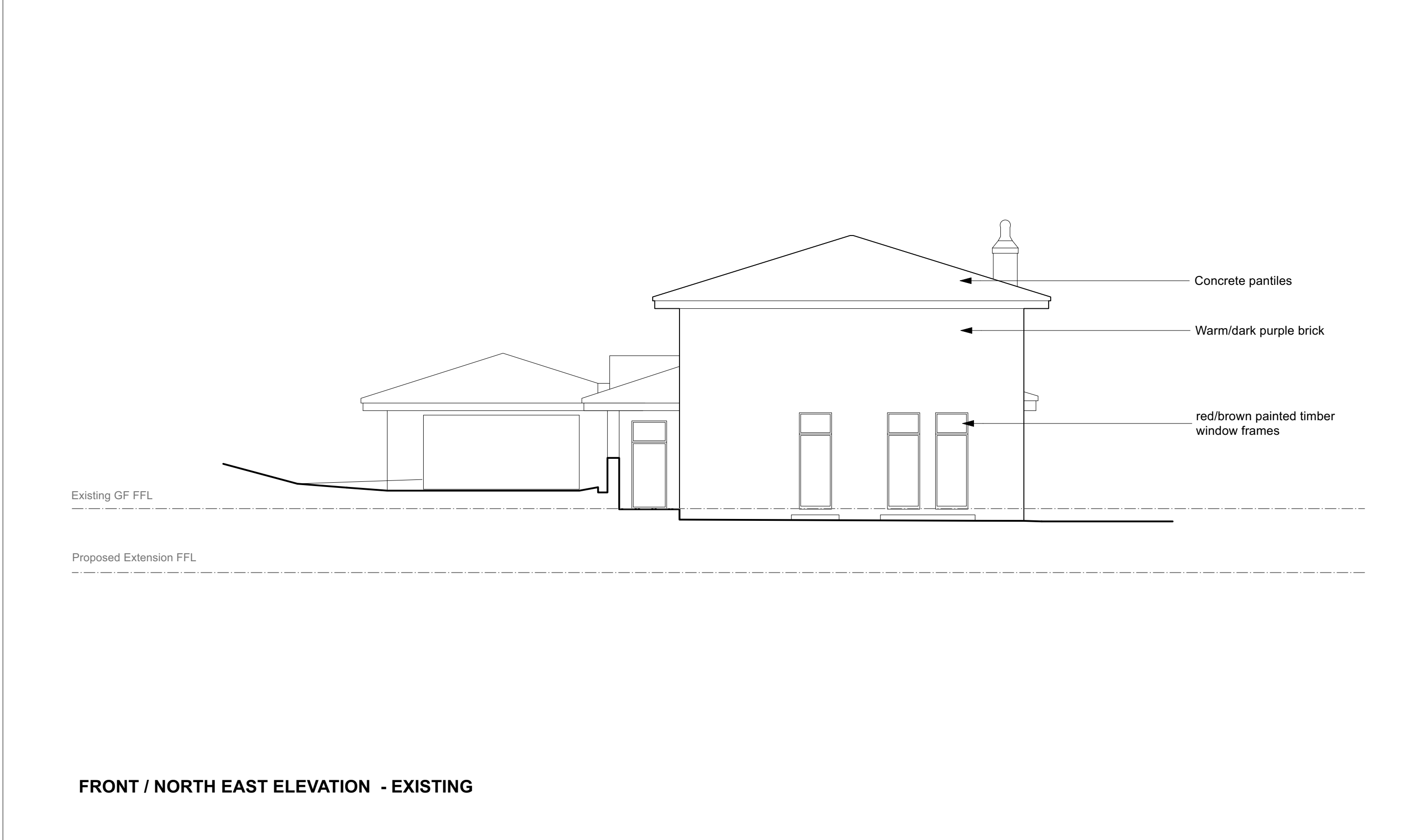
FRONT / NORTH EAST ELEVATION - EXISTING