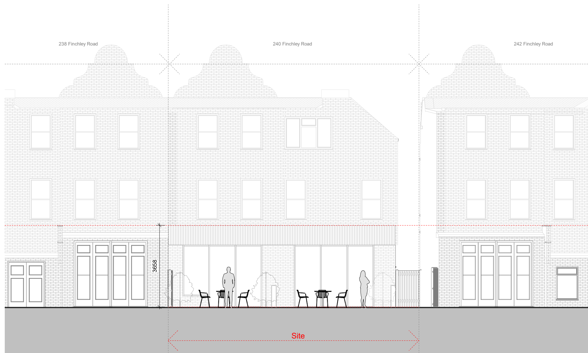
1 Rear Elevation - Proposed 1 : 100

(c) - Kristofer Adelaide Architecture. Registered Company based in England and Wales (No.10782421)