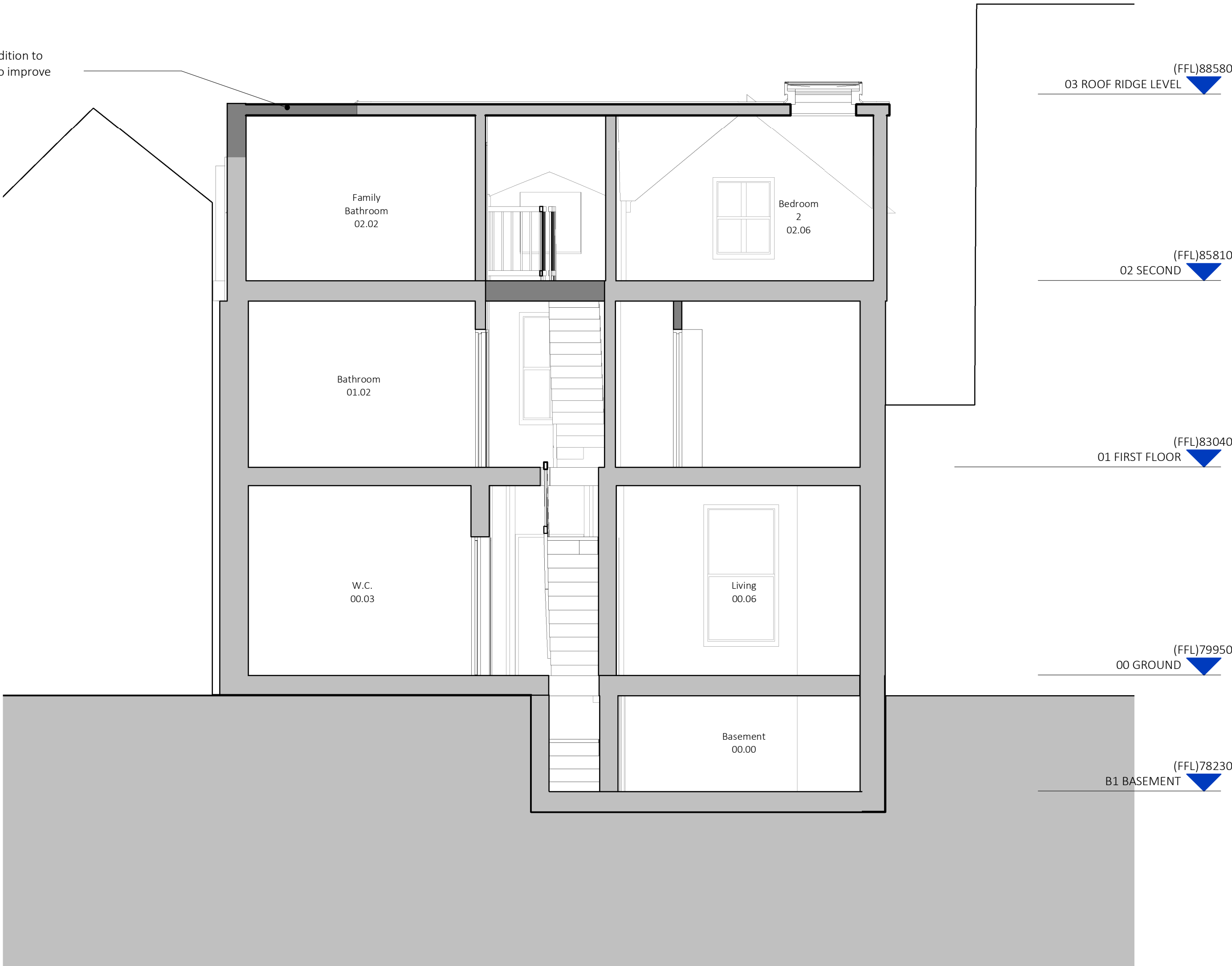
1 1 : 50 PROPOSED SECTION B-B

New roof piece addition to existing flat roof to improve ceiling height