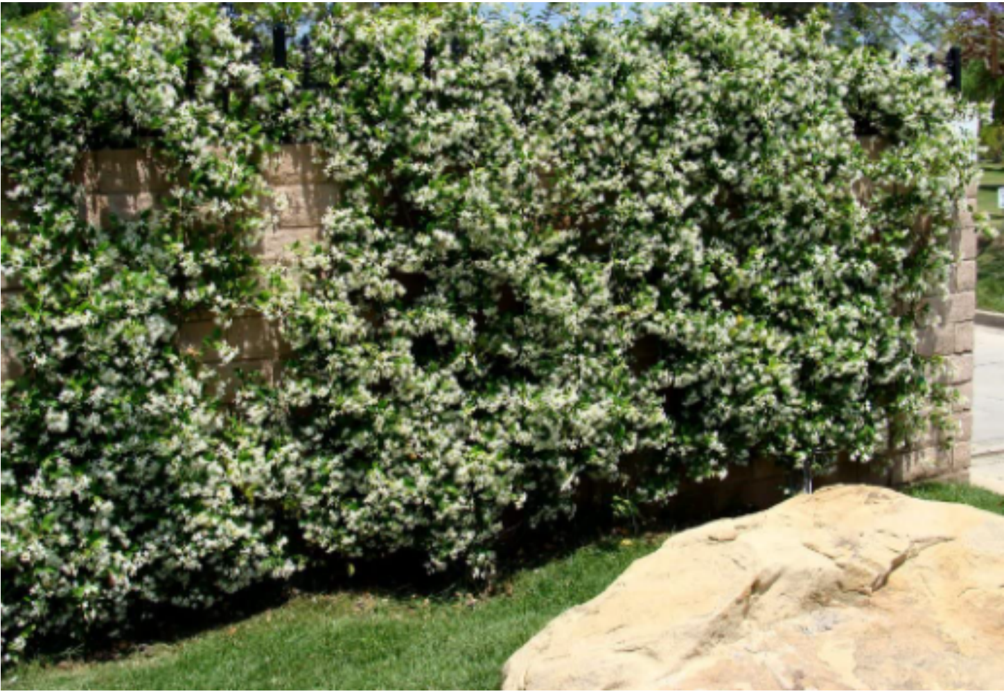
Trachelospermum evergreen climbing jasmine