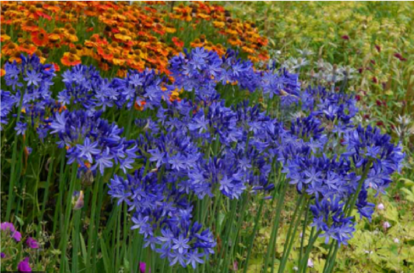
Agathus northern star

DO NOT SCALE FROM THIS DRAWING (Construction Stage) Figured dimensions only are to be taken from this drawing. All dimensions are to be checked on site before any work is put in hand. If in doubt, ask. Any discrepancies to be highlighted to 4H Architecture prior to procurement and in good time. Copyright © 4H Architecture 2022 Registered in England & Wales. Registered No. 12112149