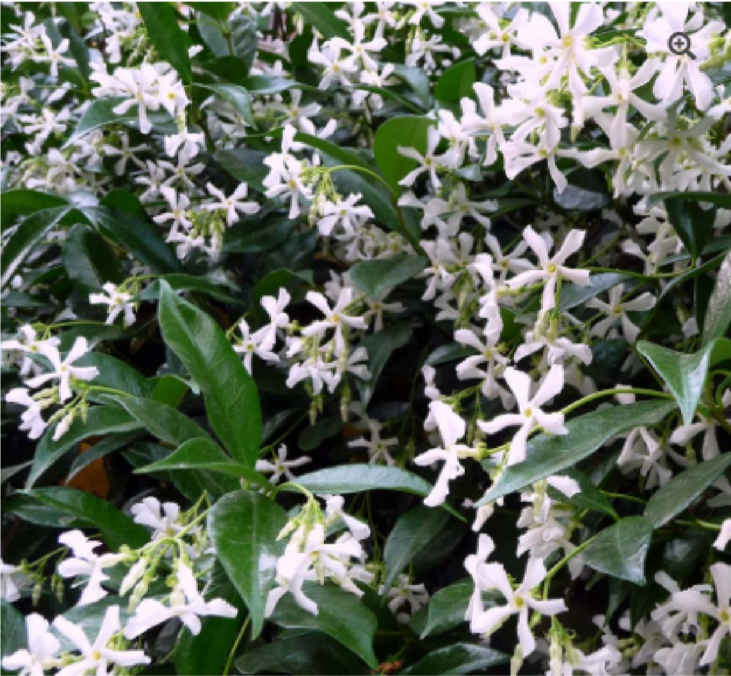
Trachelospermum evergreen climbing jasmine