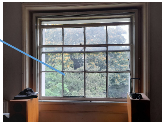
Front Elevation Not to scale

New Bespoke box sash windows manufactured in timber to match all details of adjacent existing windows