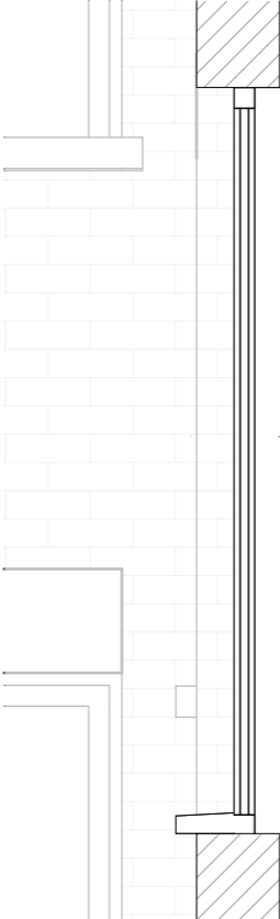
... Proposed Window Section1:20.