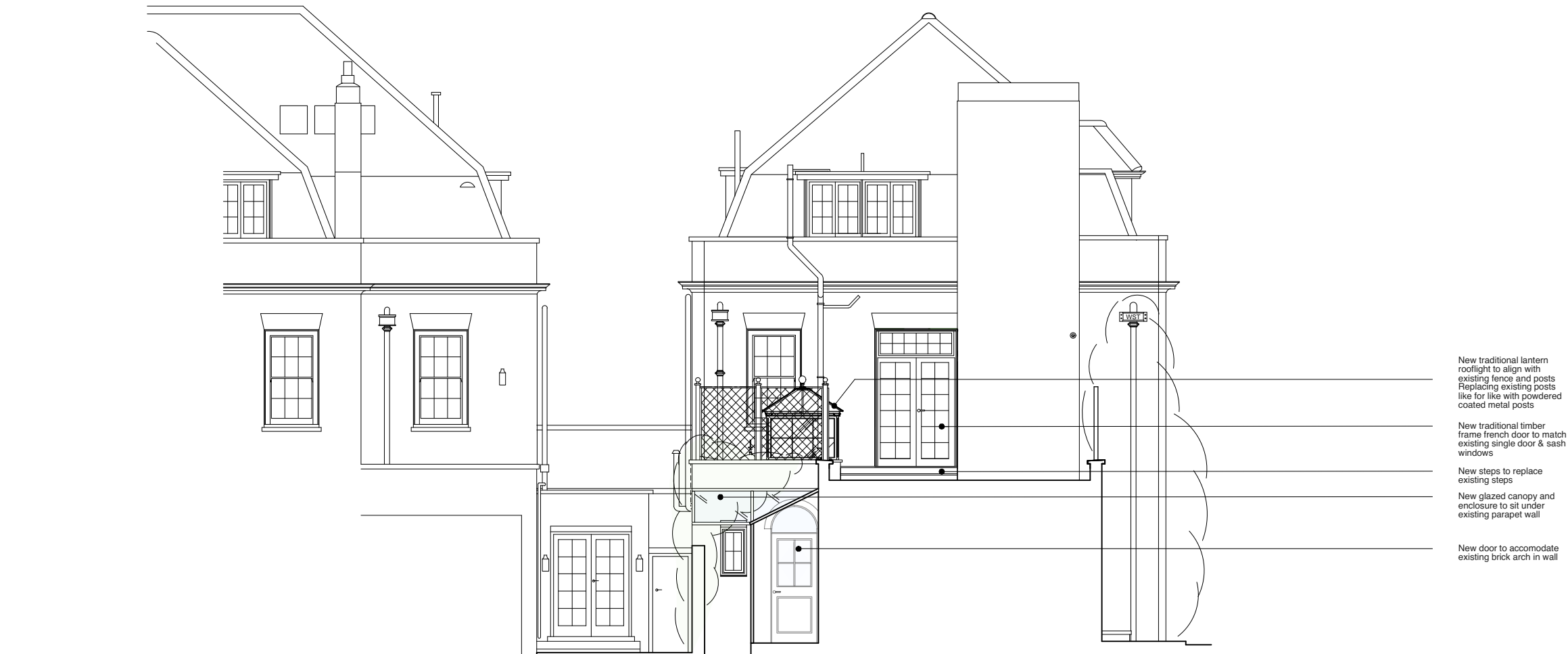
PROPOSED NORTH ELEVATION - REAR ELEVATION

New traditional lantern rooflight to align with existing fence and posts Replacing existing posts like for like with powdered coated metal posts New glazed canopy and enclosure to sit under existing parapet wall New door with glass panel New glass door New steps to accommodate new glazed canopy and enclosure