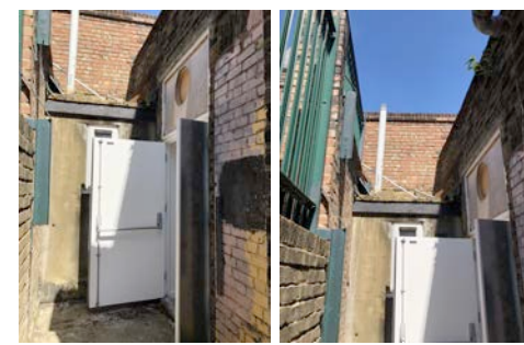
3A AS EXISTING

TO BE CONSIDERED UNDER SEPERATE APPLICATION